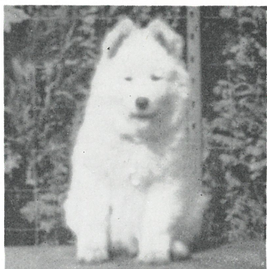
PUPPIES OF CHOICEST BLOODLINES