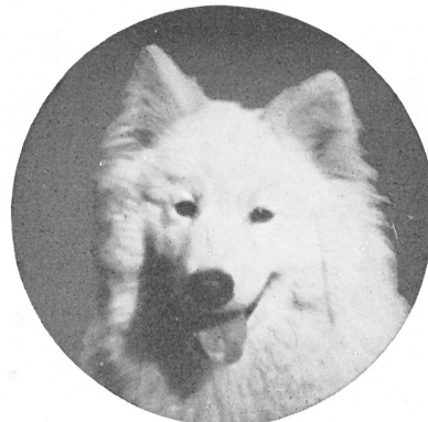
The White Christmas Sams