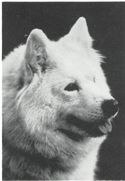
English and American Champion Princess Silvertips of Kobe