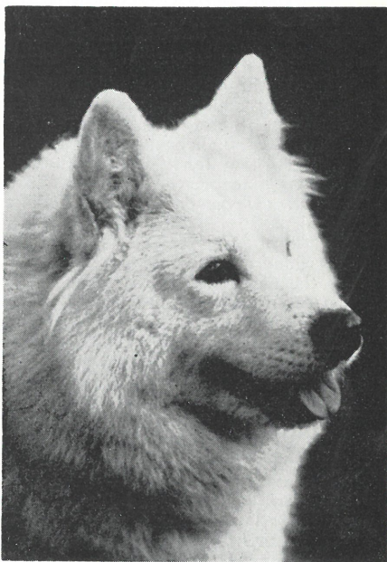
English and American Champion Princess Silvertips of Kobe