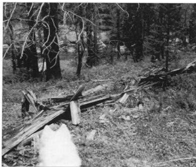
Skylark contemplates the remains of the old Tie Flume.