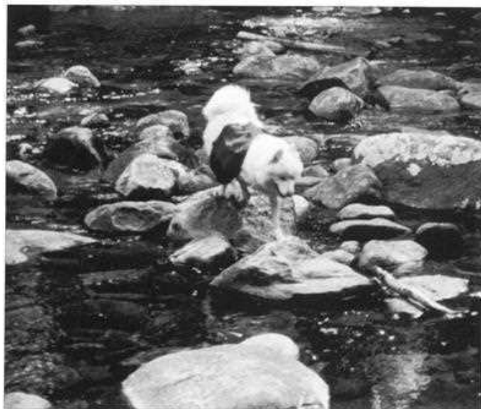
Boomer fords a creek in the Big Horn Mountains.