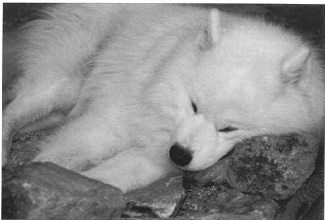
Boomer always likes a pillow, even if it's a rock.