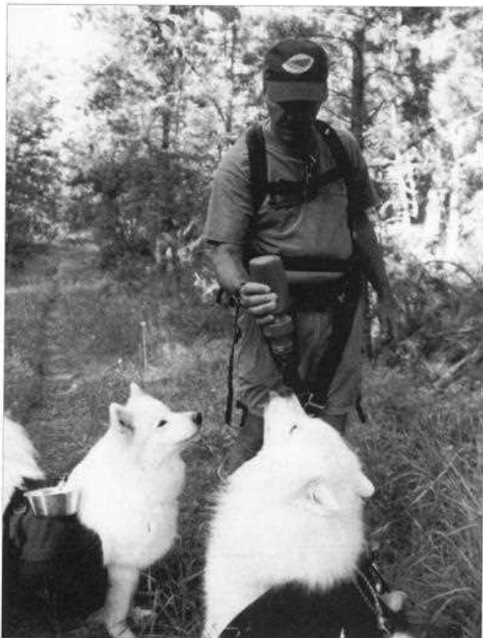
Boomer drinks from the water bottle he's been carrying.

Several other creeks joined the Tongue River, creating a number of rocky fords we all had to cross. The dogs did a great job leaping from rock to rock. I, on the other hand, was much less graceful, and wound up on my back in the middle of the creek at least once. With some of the larger fords, we found that it was easier and safer for one of us to go across without a dog, then call the dogs across. If a dog and I tried the rock leaping together, but didn't stay in sync, one or both of us was going to get wet. We carry long lines with snaps for situations like this, especially if the current is very swift.