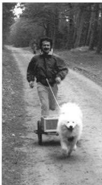
Am/Dan Ch. Bubbling Oaks Fast Break, "Fatsy," on a training exercise in Denmark.