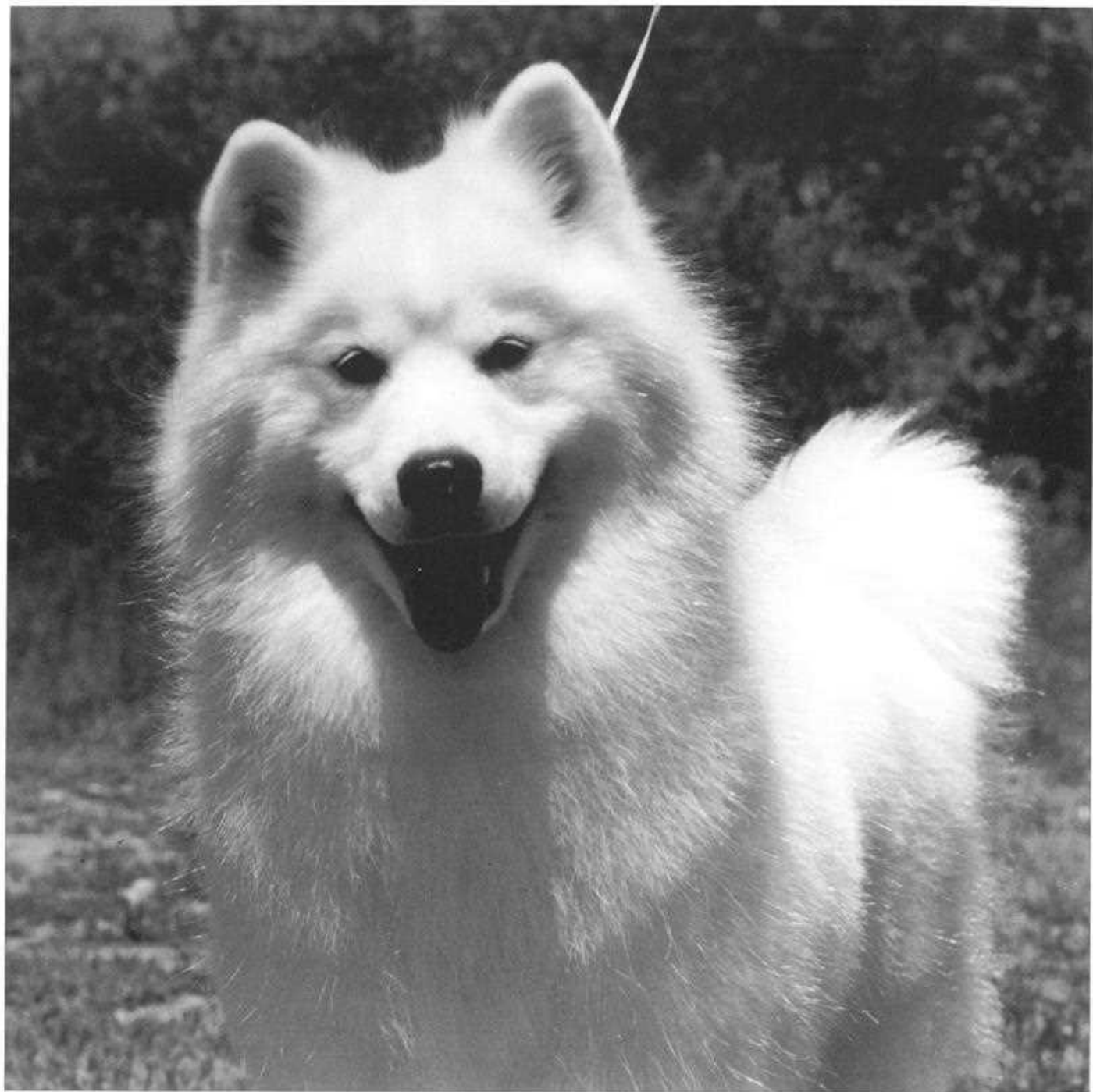
Am/Can Ch. Bubbles La Rue of Oakwood. Love this picture - it shows the silver tip so well.