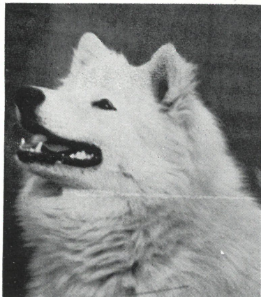
Altai Kennels' English Bred Peg O'Mine by Snowland Canras out of White Witch of Stiria