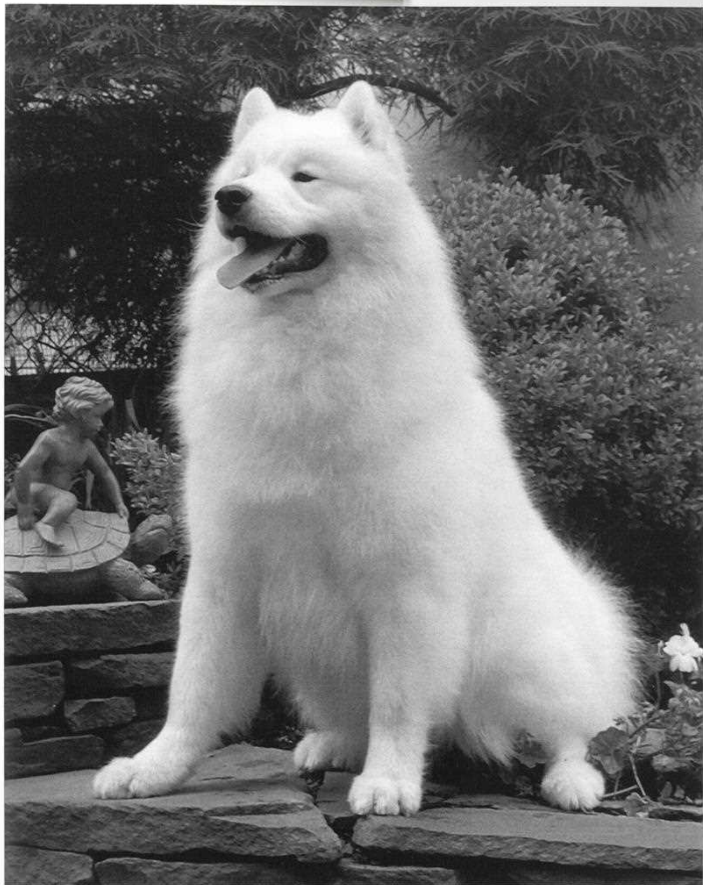
Ch. Alpine Glo's Gambler's Image, "Monte."