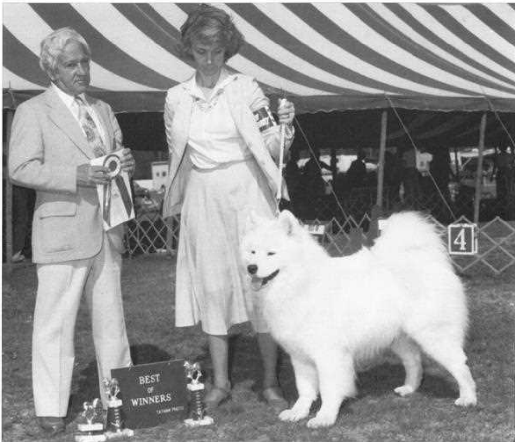
Ch. Nentsi's Nachala of Alpine Glo.

People think there are type differences in different parts of the country, but I think we are reducing those differences now because people buy dogs and breed to dogs from all over the country. Chilled semen can be shipped easily so breedings to top-producing stud dogs can take place anywhere today which allows breeders to use those same stud dogs. Offspring of these dogs are competing everywhere. I believe there's less difference now. You still see larger dogs on the West Coast, and there are still regional differences in type, but I think we are seeing some change in that.