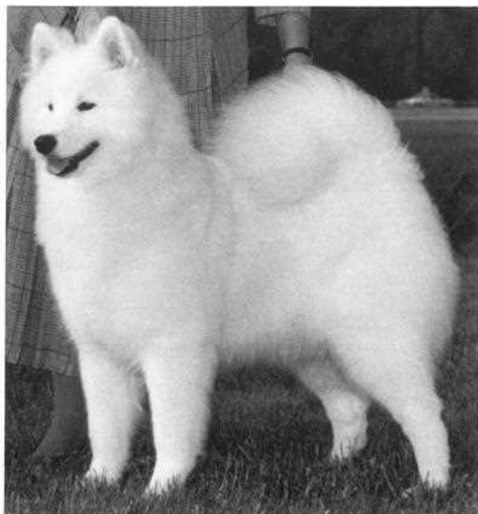
Ch. Alpine Glo's Major Sensation.

Regional specialties are important as well because you want to see what is in your area or other areas of the country. Depending on the judges, people come from pretty far away for