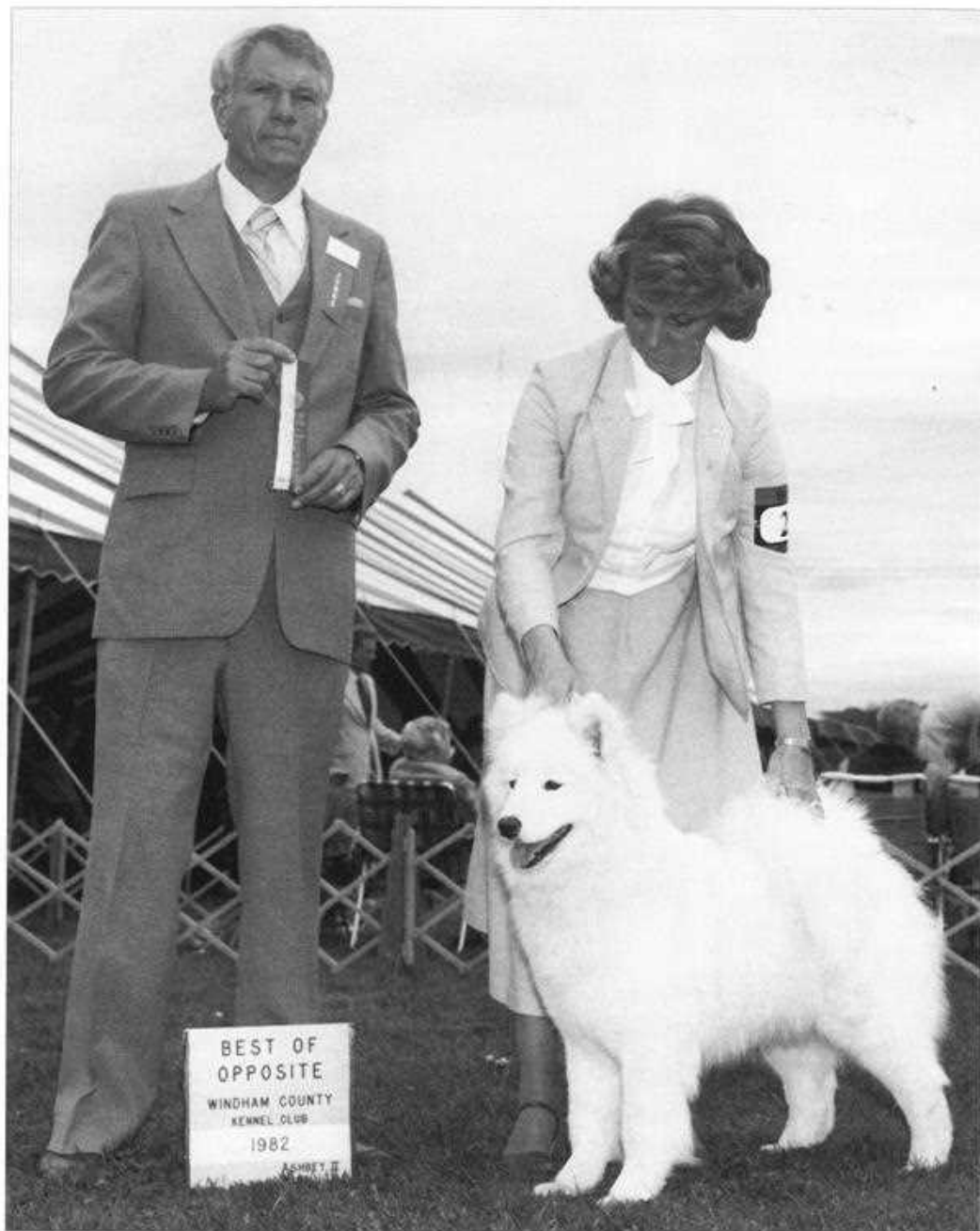
Ch. Sherica's Sierra of Alpine Glo, whelped November 29, 1980.

There are probably one or two things I would like to see changed, but I think that the standard of our breed has been around for a long time, so as a breeder, I have tremendous respect for our standard. It's one of the better standards out there. It allows enough room for interpretation, as we talked about earlier. It really does give a picture of what a Samoyed should look like, and it keeps in mind what these dogs were originally bred to do. I don't have any major arguments with our standard. I would like to see the Illustrated Standard updated by a first-rate artist who knows and understands dogs. I think it would be a wonderful tool for judges and exhibitors alike. However, when judges are applying to judge Samoyeds they should be educated about