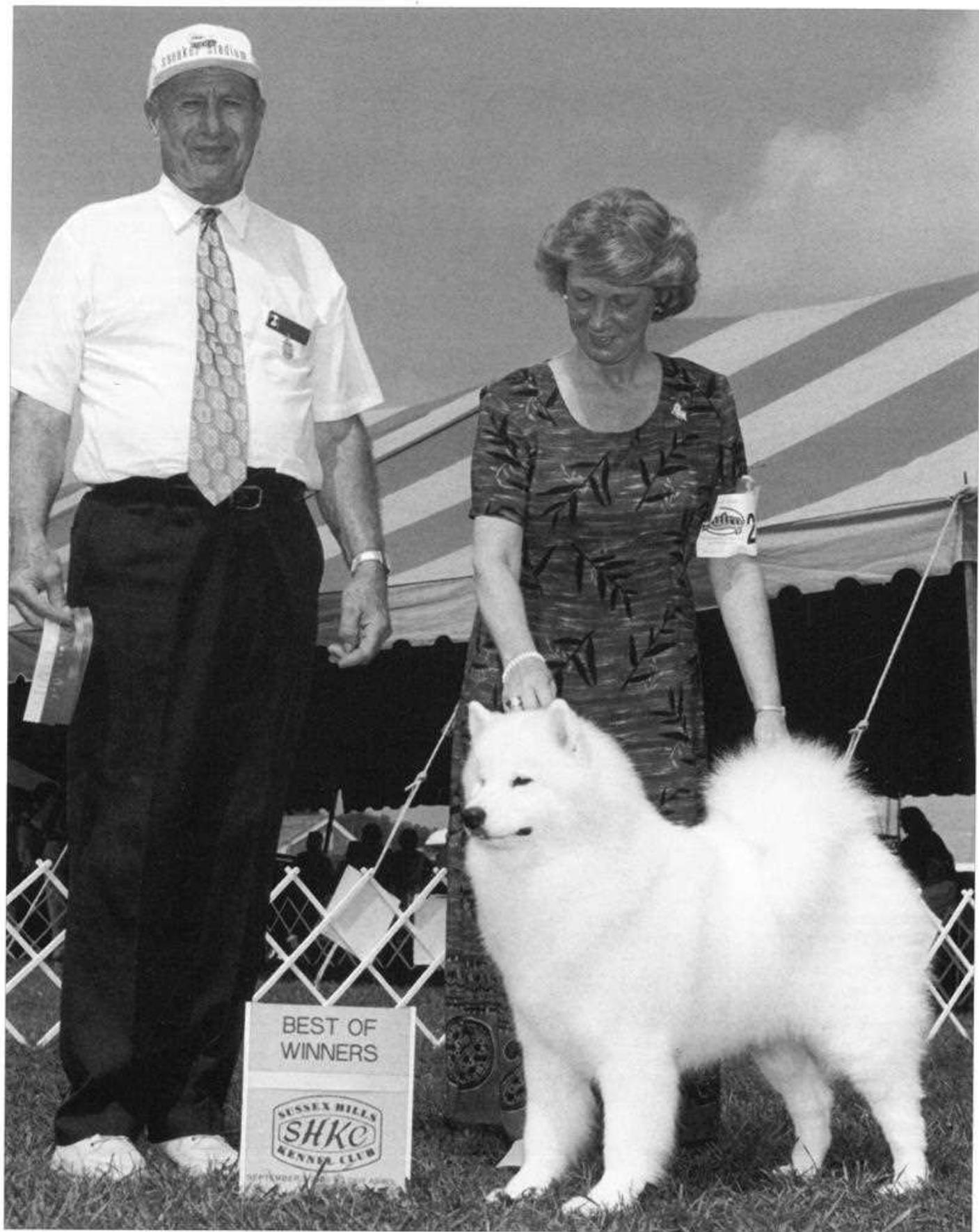
Ch. Alpine Glo's Piper's Glory, "Glory."