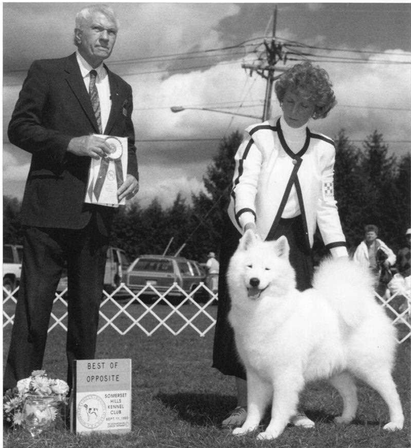
Ch. Alpine Glo's Ice Blue Sensation.

and had garnered nine points. We were both unknowns, and that's as honest as it gets, you know. (laughter) That was memorable.