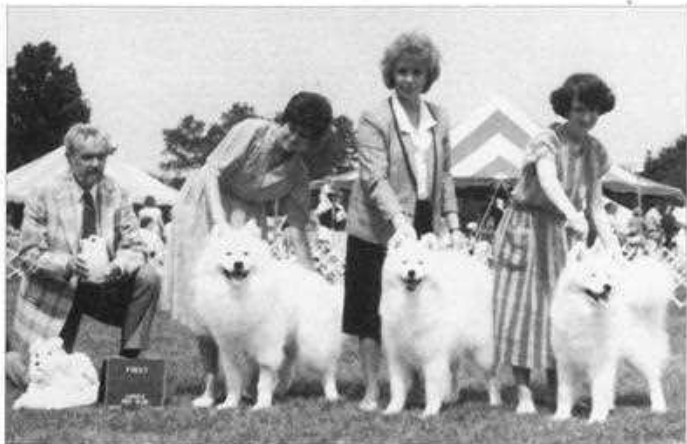
Ch. Major Keno Sterling O'Stardan shown winning first in Stud Dog class at the Minuteman Samoyed Club Regional Specialty, 1984, with daughters Ch. Alpine Glo's Major Attraction and Ch. Alpine Glo's Major Sensation.

and one of the things that I ask for in a stud dog that I am considering. PRA is something that we can wipe out in ONE generation. The mode of inheritance is a sex-linked trait in Sammies, so if you do the test you know you don't have to worry about it.