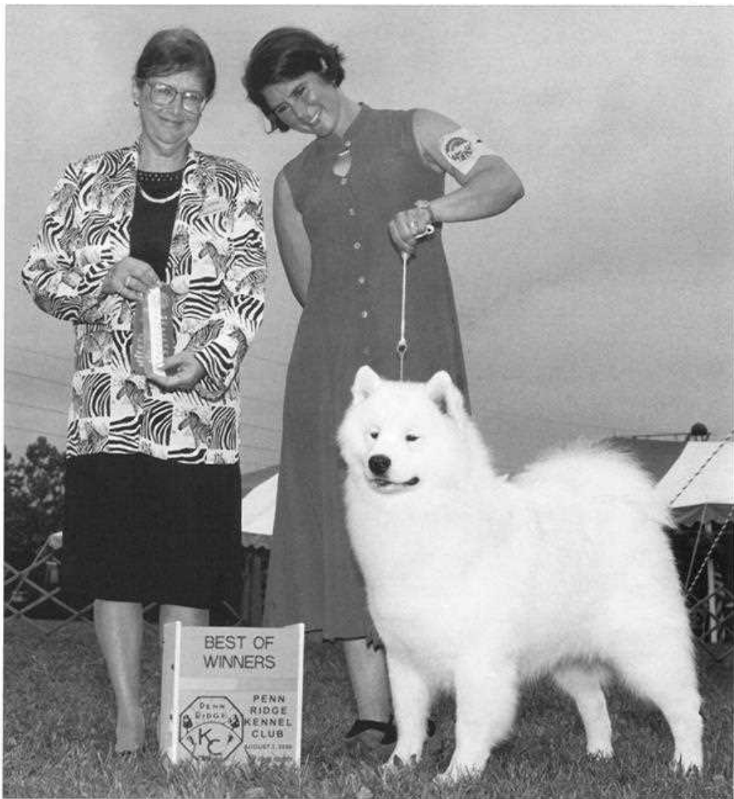
Ch. Alpine Glo's Gambler's Image, "Monte."

Some dogs just have it naturally. I've had dogs that just showed. I had a bitch at one point who was out of an Ice Breaker daughter, bred to Ch. Iceway's Ice Crush. She was one of the cutest bitches I think I've ever owned. She was adorable. Her name was Am/Can Ch. Alpine Glo's Mercedes Benz, "Sadie," and that bitch showed from the day she could walk. She just said, "Look at me!" We won Best of Winners at the Canadian National