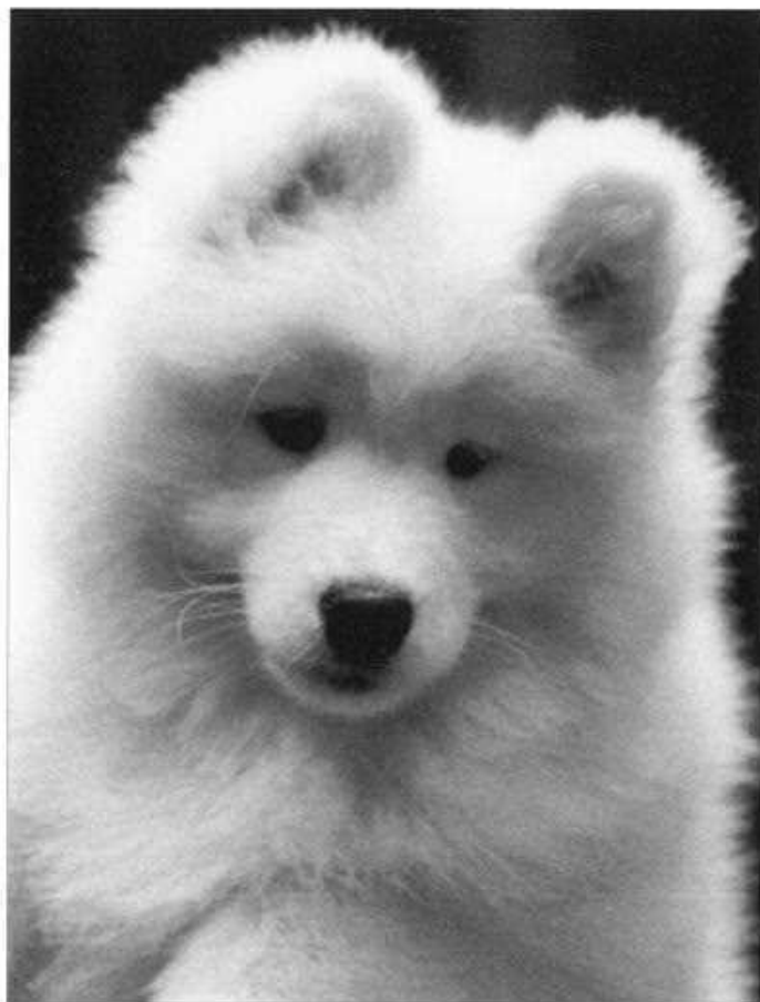
Am/Can Ch. Alpine Glo's Mercedes Benz, "Sadie."

testing, and the Samoyed Club of America for three years in a row has provided Optigen clinics at the National Specialty. It is a simple blood test that will give you genetic information on whether or not your dog will develop progressive retinal atrophy (PRA). As these genetic tests become available, we will have even more information available to us.