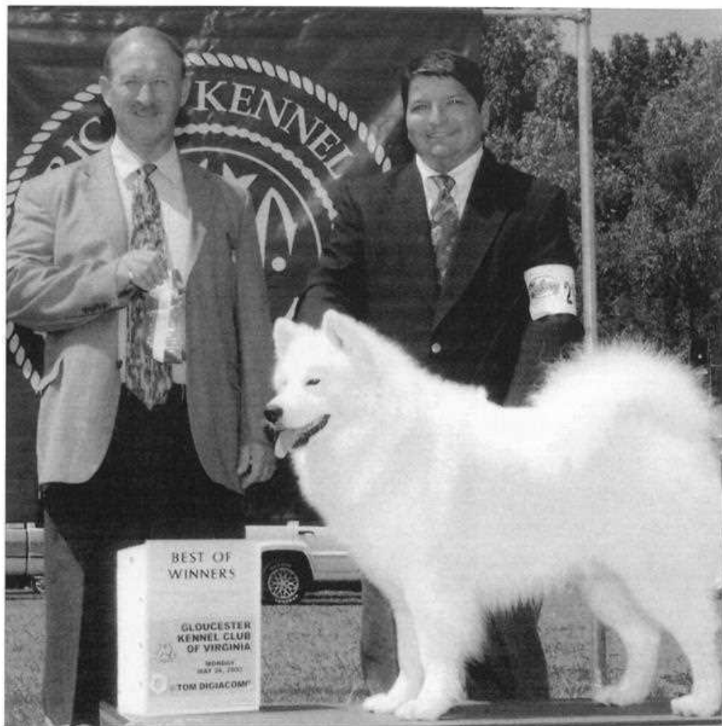
Ch. Barbicon's Sail of Alpine Glo.

That has happened to some of my dogs, too. You live in an area where there aren't that many dogs running around, and you keep your dogs fenced in to be safe, and you have to really socialize them to get them used to other breeds. That is why acclimating them and getting them to as many shows as you can is so important. That is part of something - I wouldn't call it a ritual, but it is an intelligent