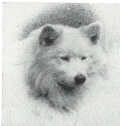
Puppies Occasionally — Selected Breeding Correspondence Invited JULIET T. GOODRICH