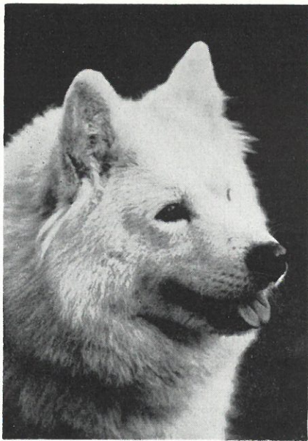
English and American Champion Princess Silvertips of Kobe