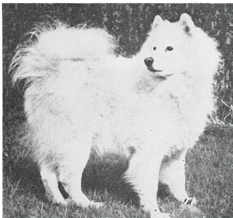
Sniejok of Norka "How to Train Your Owner" June 13, 1936 — February 10, 1950

He loves his home, and sleeps in it every night, and uses it for a retreat from the sassy little Sammy puppy called "Frosty"—who gets