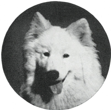
The White Christmas Sams

Snow Maiden of Snowland Kara Kobe of Oceanside Lensen's Snow Chief