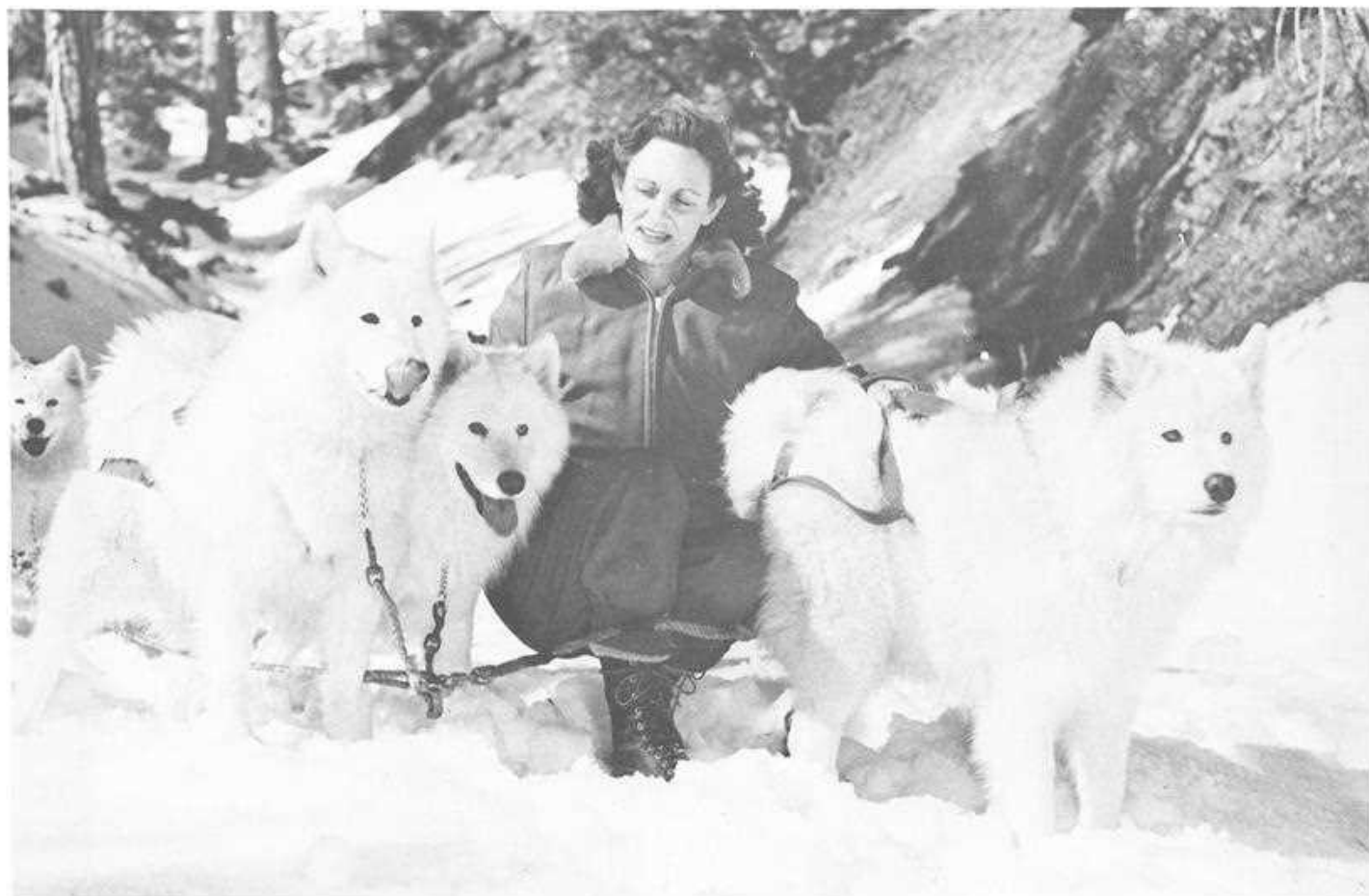
Starch, Musty, Shaman, Topper - 1952.

and do at least two a night, to keep it up. They say you either go wholeheartedly or ... when I gave up running and showing, I just quit. I quit almost everything.