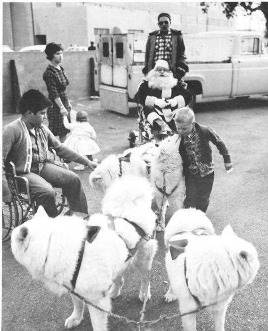
1961 - Bringing in Santa at the Crippled Children's Association.

never gave up, never hurt or cried. Oh, by the time she was thirteen or fourteen, she groaned ... but so do I, and I'm not dysplastic! (laughter)