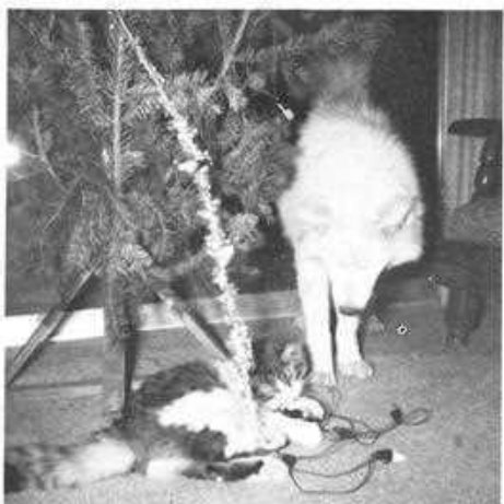
Zac - trimming the tree!

Do you think that breeder-judges make better judges than all-rounders, as a rule?