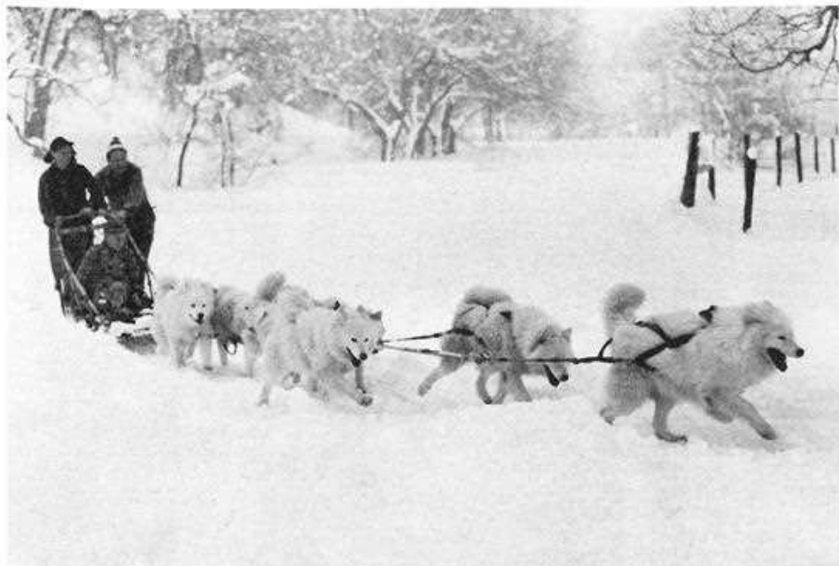
Starch, Musty, Tinda, Yukon, Topper, Nicky, Frosty 1950 - Frazier Park

alert and looking around, to see what they can get into next.