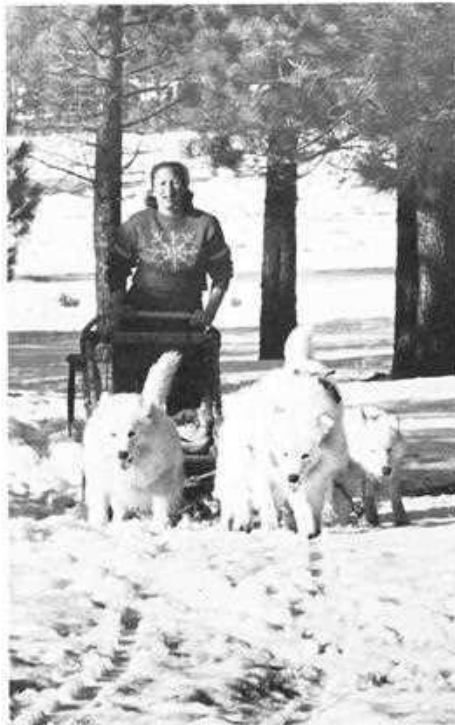
All champion team, 1960, Big Bear

Oh yes! Now that I'm old and gray, I've got my scrapbooks, and my movies. And I give lectures a lot. Just two weeks ago, I went to Santa Barbara, to the obedience club, and showed some pictures and my movies. It's fun. I've met a lot of nice people, and have a lot of friends all over the country. I know that if I ever take an