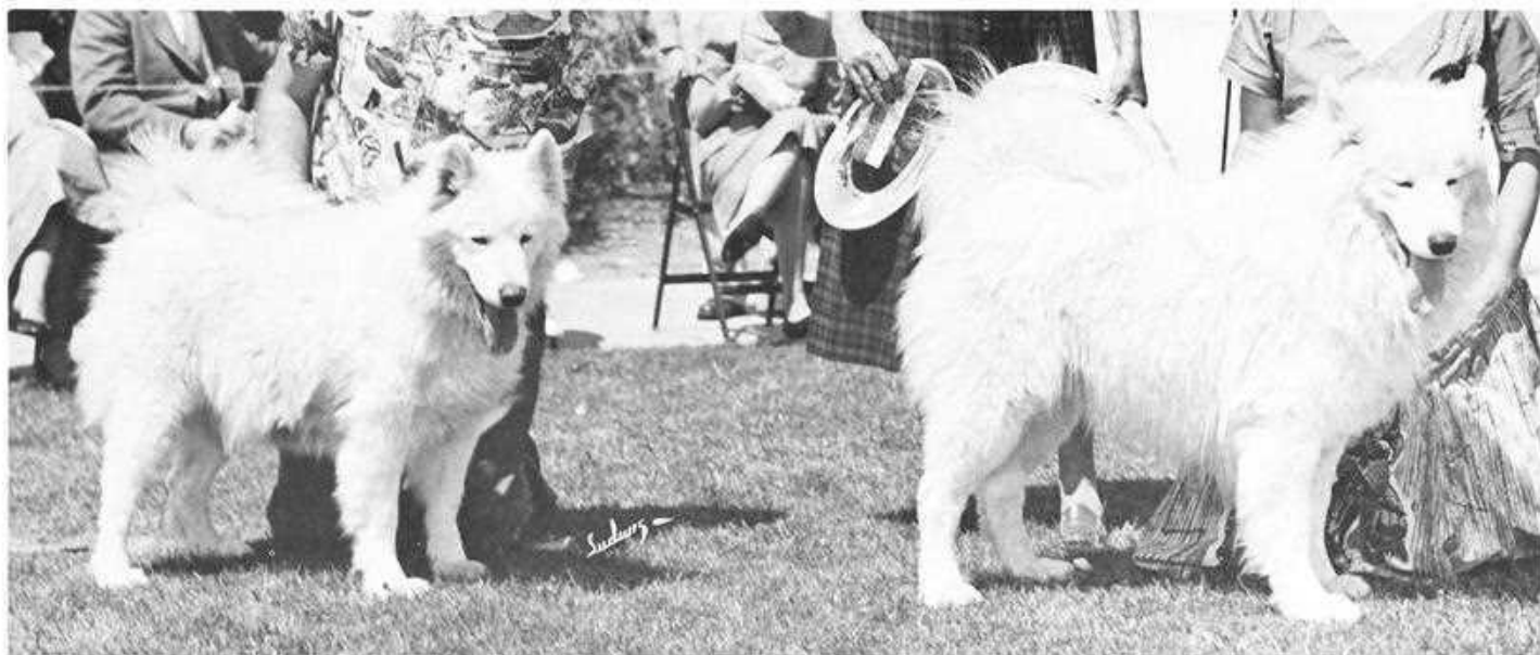
Ch. Princess Startinda BOS and Startinda's Tainik BOB, Mother & Son - Glendale, 1955