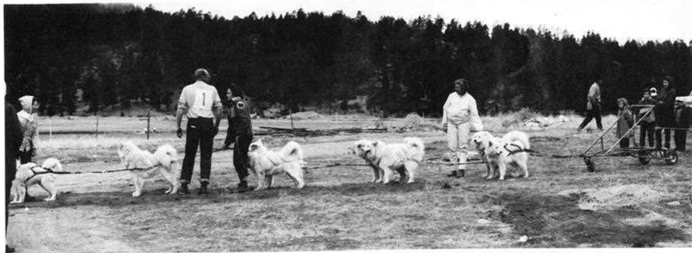
Tsar, Stormy, Tinda & Kara, King & Teddy, Zack & Prince