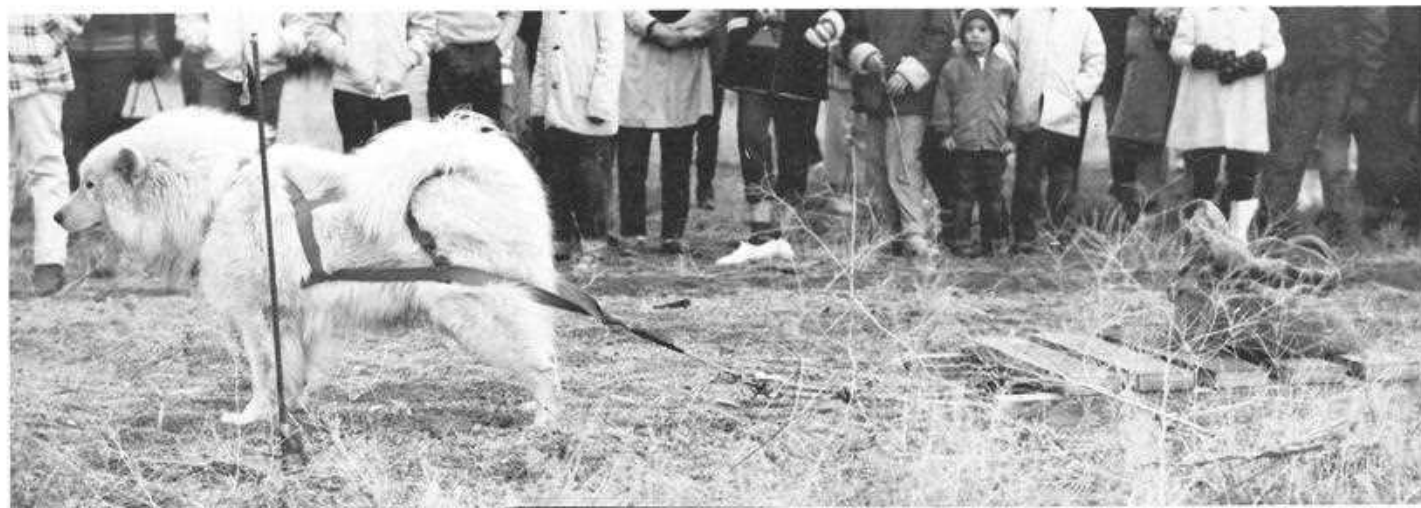
Prince - weightpulling

That's the way it was with this bitch, she was a beautifully moving bitch. She was the mainstay of my sled team for twelve years, and she worked, and ran those sixteen miles two days in a row and never limped,