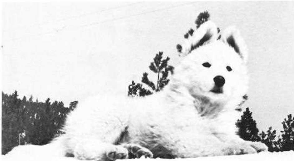
Startinda's Chogpon, at about 10 weeks.

My daughter won her first trophy in a children's race with one dog. She was four years old. There were times when she said she was holding the lead dogs, she was scared stiff that they wouldn't stay the way they were supposed to, and she would be dragged. I'd keep saying it's all right, but I guess it must have been terrifying for her, and I didn't realize it. They both got a smattering of the TV. They both