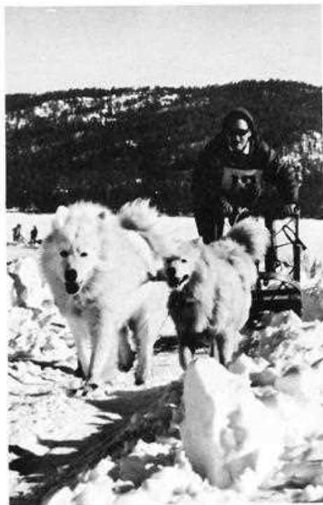
Tsarpet in lead, finishing at Big Bear

I'm an engineer, an aeronautical, structures-type engineer. I graduated from college and then came to California to get my Masters at U.C.L.A., and then took my engineering courses at S.C. I went to work for Lockheed, and they needed engineers, and I switched to Northrup and worked for them for over 25 years. I retired two-and-a-half years ago. I was married and had