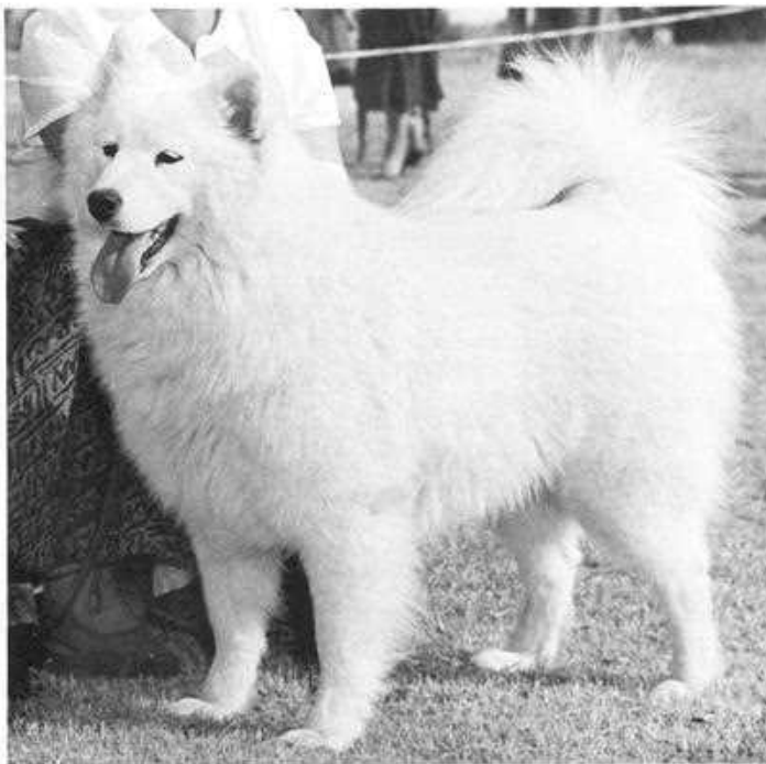
Ch. Startinda's Cheena - BOB - 1957, Hemet