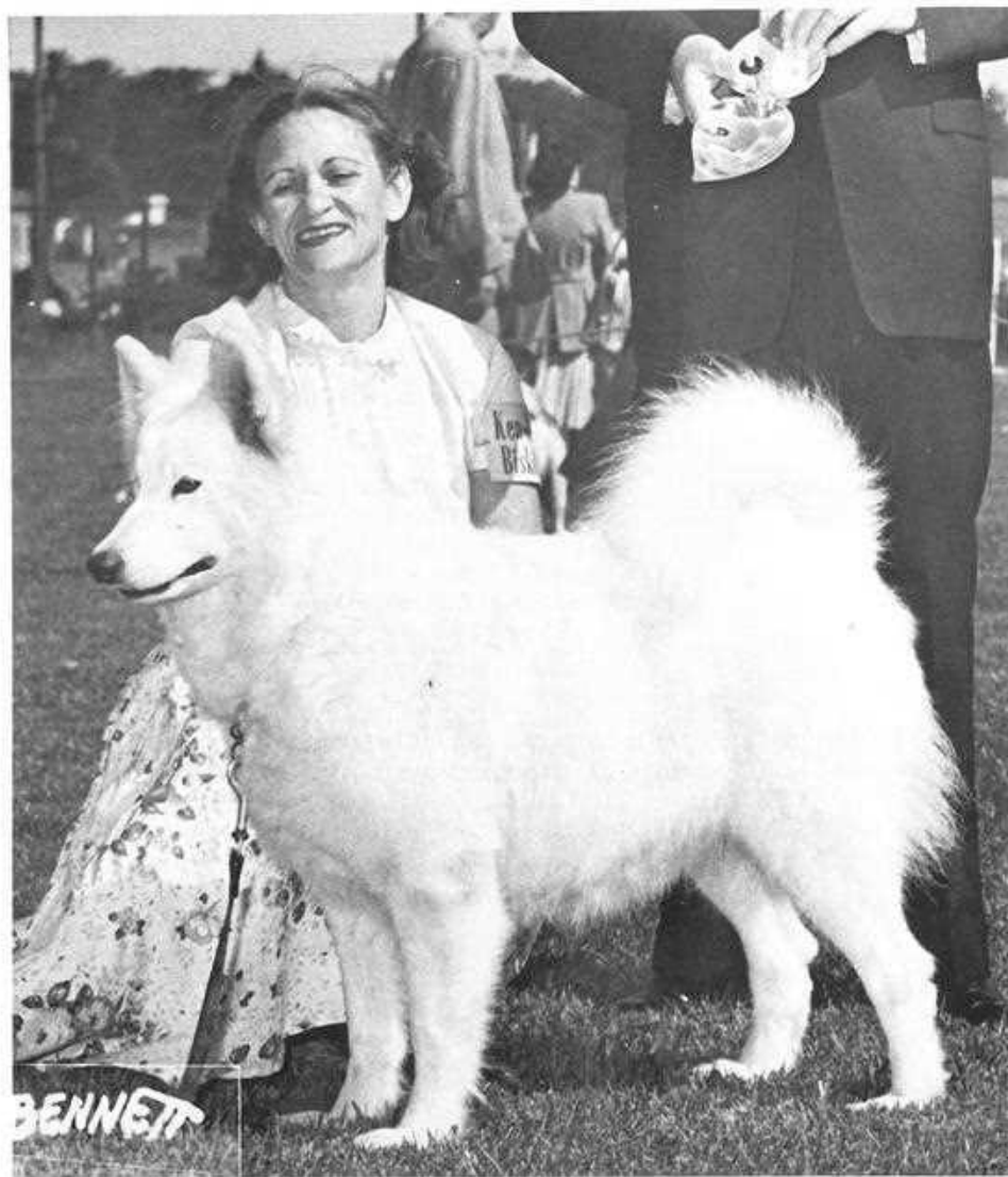
Chrinda, San Francisco - 1957

a very good idea about how they're going to move and how they're going to stand. You get so you can mark one, and say I know this is the one the day it's born. Then you see how close you are. But you'd be sort of silly to do that just on looks that day, and stick with it. Sometimes it works out that way, but I like to see them when they can move. I let them run a couple at a time so that I can study them together, and let them run in the yard by themselves and see how they move. Because you can't tell in a box. As I