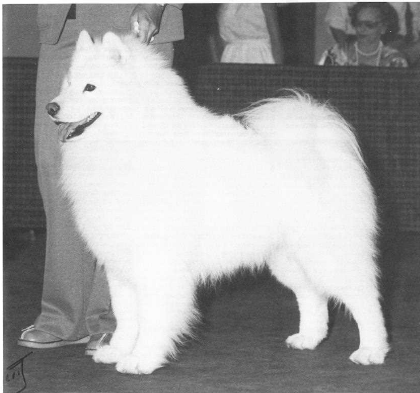
Am/Can Ch. Kohovitch of Polar Mist CDX, Can. CD.

things are dropped. I have seen that happen a lot. Of course, a club is only as good as its members and if you have people who are willing to work that always helps.