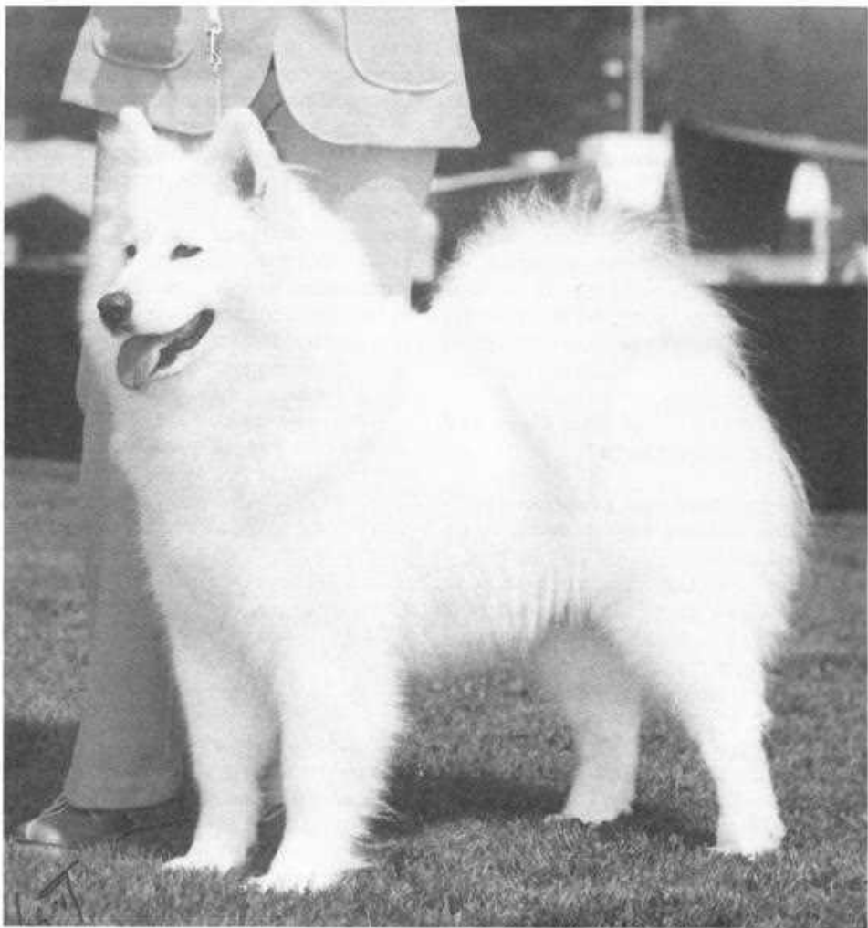
Am/Can Ch. Pepsi Kola of Polar Mist.

very seldom. They just automatically tend to go to the end of the run and go in the gravel area. I like to keep the dogs on decking. It is so much better and healthier for them. It can be washed and disinfected. The gravel can be washed and disinfected. I don't like to see my dogs on concrete. I know what it is like if I stand on concrete all day. It is real harsh on their coats, the coats tend to get stained easier. It is hard on their structure standing on concrete all the time. I like the