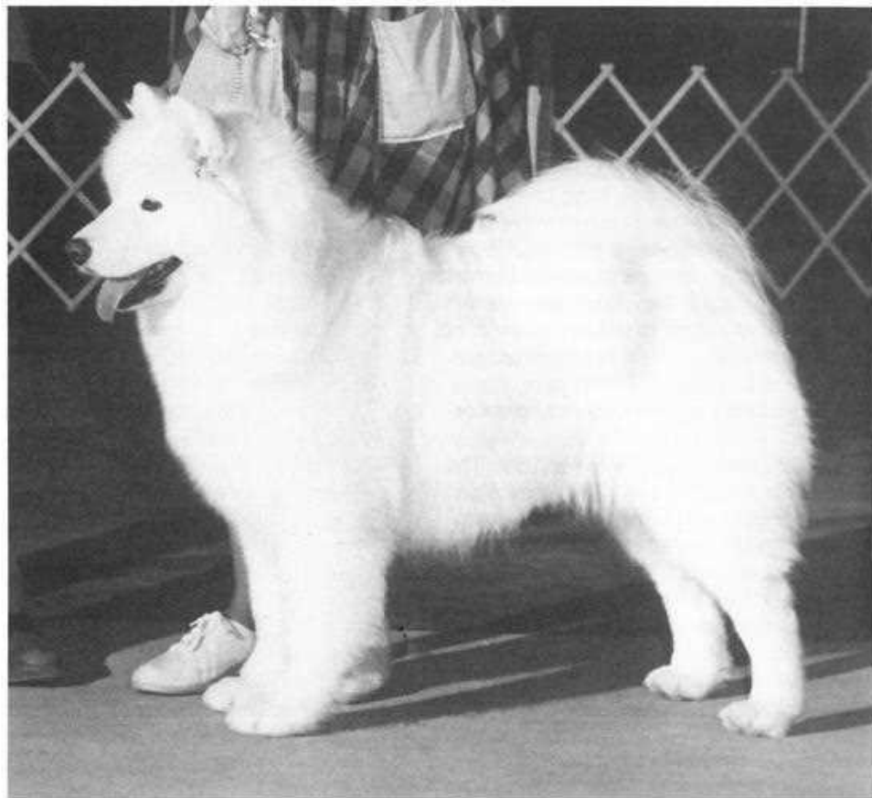
Am/Can Ch. Polar Mist Ice Vixen.

When I start off with a young male I am right there. If I have to hold the bitch I encourage them and talk to them. I always talk them into it, telling them that it is okay. I had a dog that if there was a bitch for