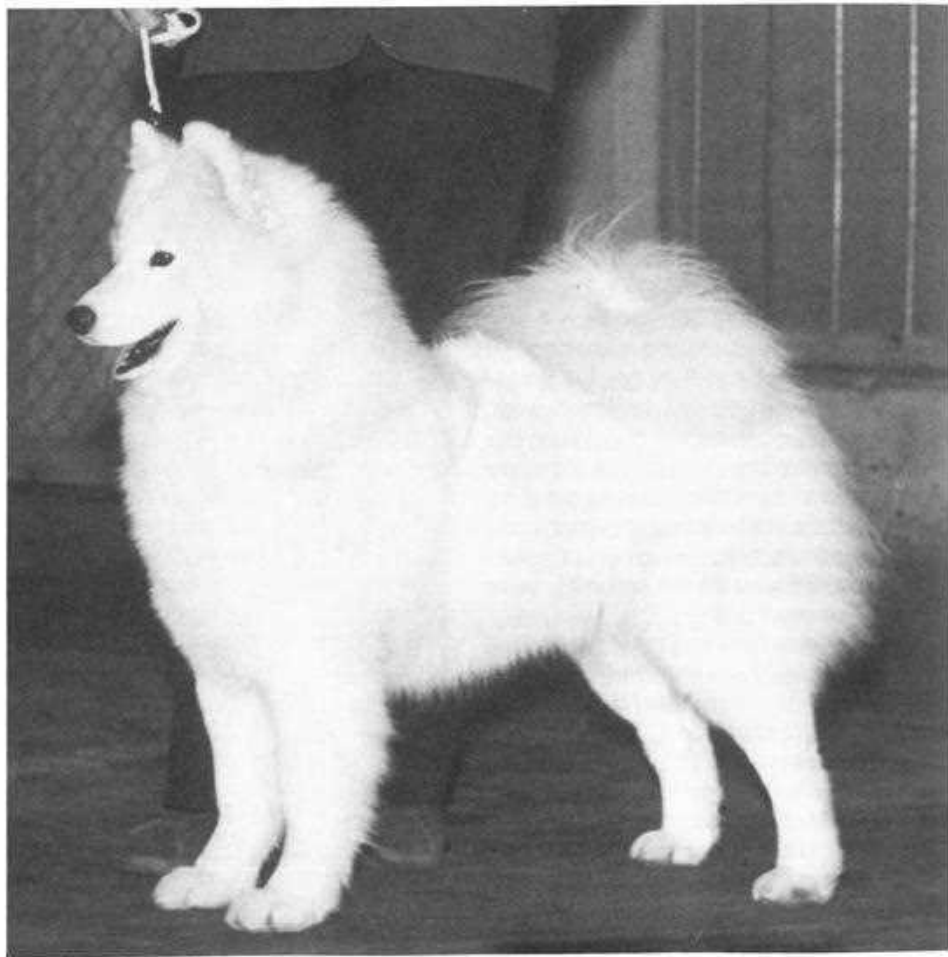
Am/Can Ch. Polar Mist Ain't She Foxy.

Years ago I used to wean the puppies myself. I don't like doing that. I have found I just prefer to let the mother do it themselves. It works out much better. I used to say when they were six weeks old it was time to take the mother away. I would have upset mothers and upset puppies. It just didn't work. I let the mother totally do it on her own, although I do start feeding them by four weeks of age. I have had bitches nursing her puppies until they were shipped at ten and eleven weeks old. I have had other