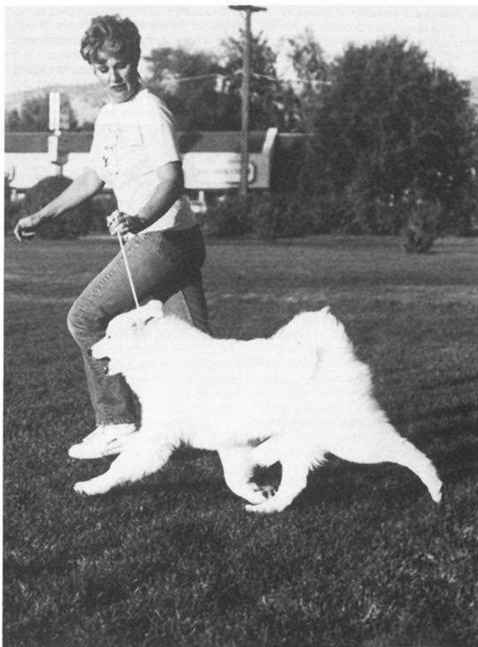
Polar Mist Jet Set'r.

person needs help and it is nice to get to know somebody in your area. It is a wonder this guy will even go back to another dog show. The person was very rude to him, very abrupt and then totally criticized his clothes,