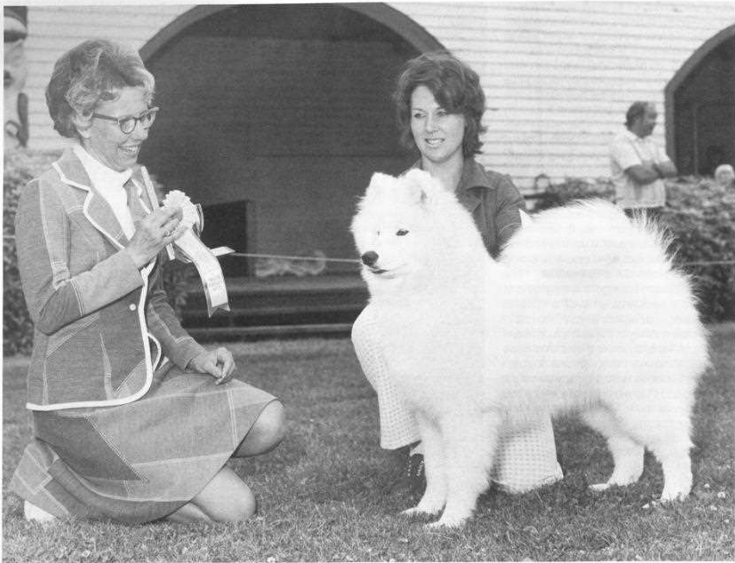
Am/Can Ch. Polar Mist Ain't She Sassy.

not contacted me and sold the dog or, in a couple of cases, given the dog to somebody. They have given the dog into situations or to people I would not want the dog to be in and I have gotten very upset about it. I started adding in my contract specifically that "if they don't comply with all the aspects of the contract all guarantees are null and void." I have also started adding "and leaves buyer open to collection of punitive damages and all legal fees." I have just put that in to help prevent my dogs from ending up in undesirable situations. You can scare people a little bit if they don't follow the contract they could monetarily end up with a problem, maybe making them think twice about not doing the right thing.