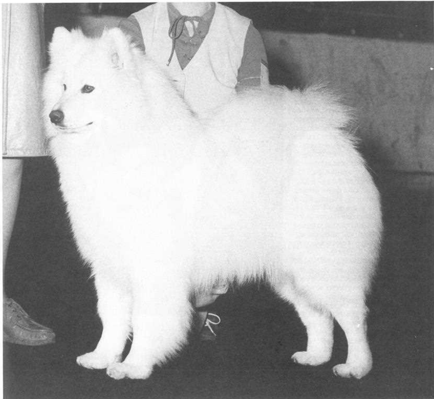
Polar Mist Baerstone Nishka.

Right. The dogs get to go. Not all the time. I take the dogs cross-country skiing but there are areas where the dogs aren't allowed and there are areas where the dogs are allowed. One thing about taking the dogs, they have a tendency, especially when you are going downhill, to run in front of you right in the ski trail. It is fun to take them out in the snow, though at times I don't want to bother with them because they get in the way. They do like to run in the trail and they