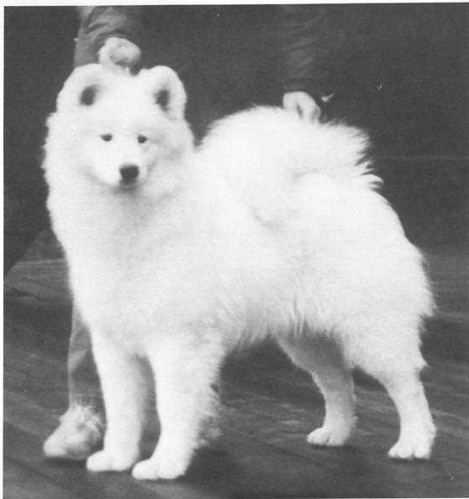
Spring at 9 months.