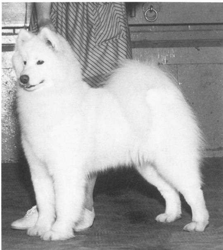
Am/Can Ch. Polar Mist Naughty Angel.

One of Minx's puppies was very little and small. He was pretty, but I sold him as a pet because the people wanted a small male. Minx is a smaller bitch and Breaker tends to sire percentages on the small side.