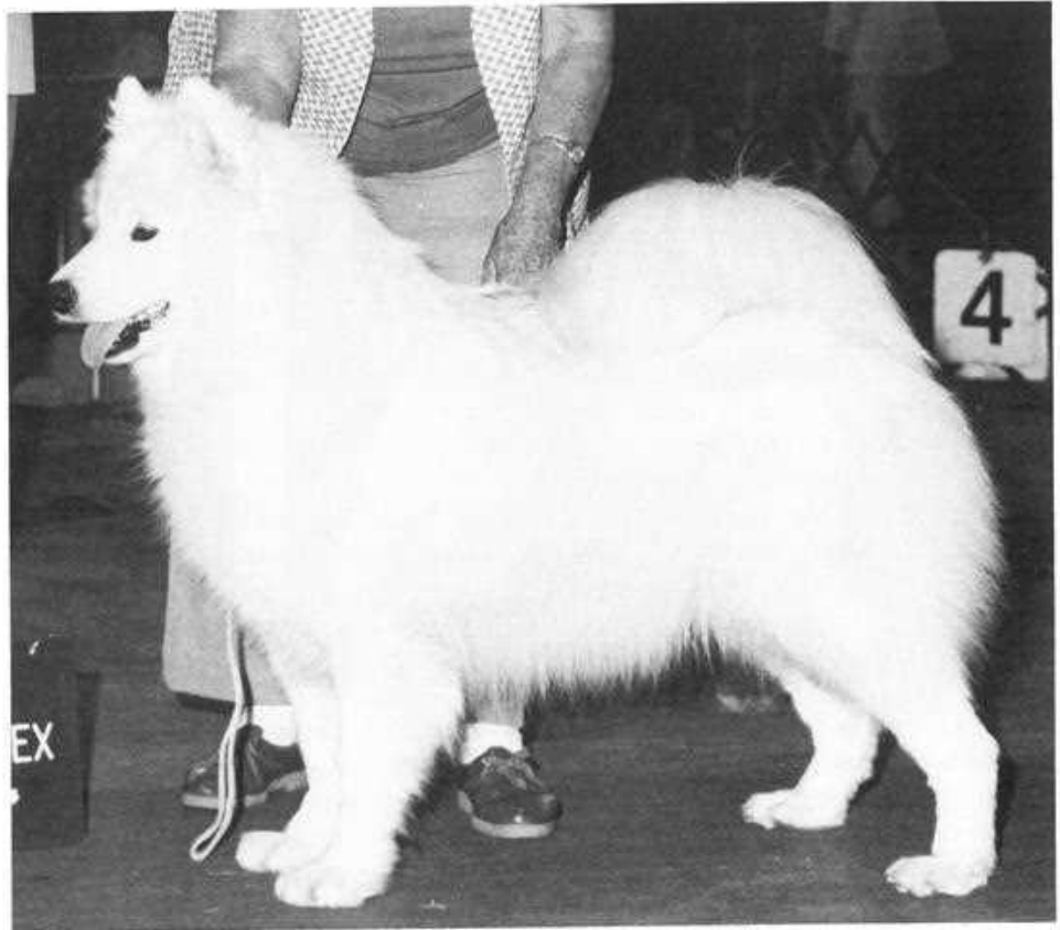
Snowdrift Snowwhite Elegance.

One of the dog food companies came out to the kennel. I wasn't there, my husband was there. I was gone somewhere. The man said, "Why doesn't she feed those dogs dry food? Then you wouldn't have to worry