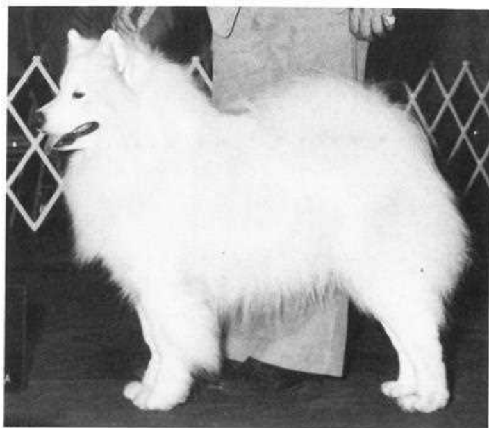
Ch. Snowdrift Silver Sweepstakes.

But we are not leaving that dog anymore because I'm not going to be responsible for her getting killed." She came over and stayed with them until they tied up. She hadn't gotten out of my driveway before the dog was out. I looked out there and there she was in the yard. My poor stud was still in the kennel (laughter) but she wanted to go home.