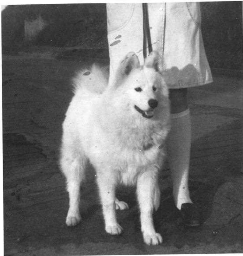
Ch. Tammikins Teddy.

dog. Not because it wasn't me but it was the wrong dog.