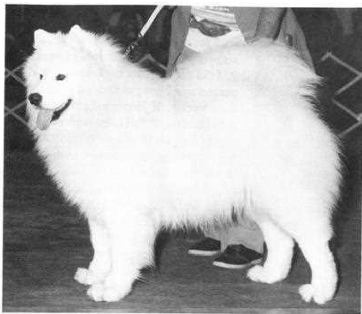
Ch. Snowdrift Moonlighter O'Kobe.