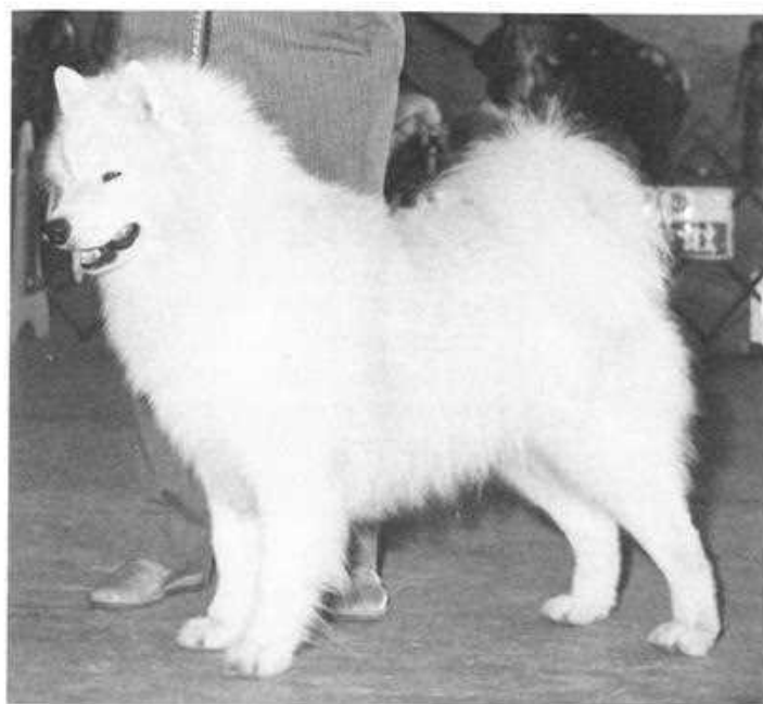
Ch. Snowdrift Whitewings O'Kobe.