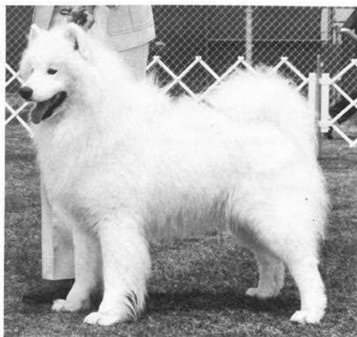
Ch. Snowdrift Grenadier Kara Sea.

house when they were five weeks old. I picked my puppy out and put a piece of ribbon on it. She took it back home and finished weaning it. When she brought the puppy back to me, it was not the one I picked, and I told her so. She had already sold my pick puppy, so I had to take it. I sold it, I didn't keep it. That soured me on it, so I tell them now that I'd rather have the money when I do a stud service. If there was only one puppy, they can keep the puppy and I will breed the dog again at the next season. If there was no puppy, I would breed them at the next season. I did guarantee it one way or the other.