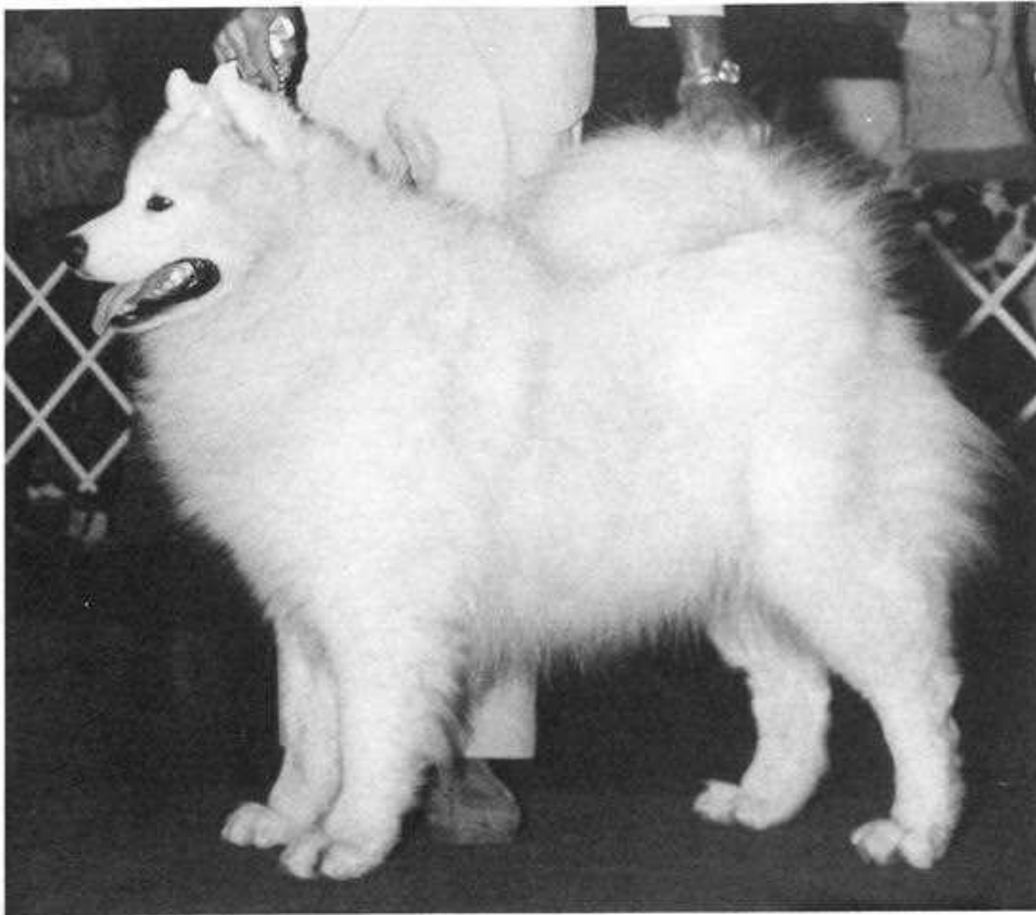
Ch. Silvermist of Kobe (English import).