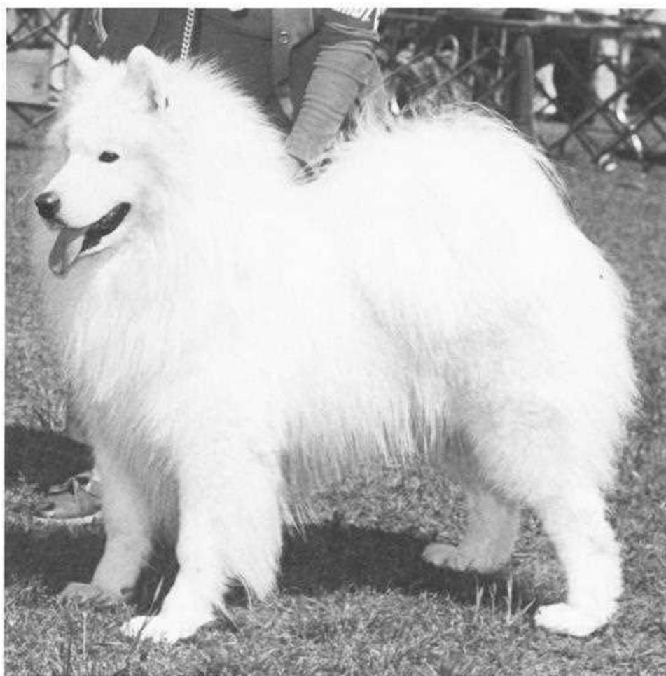
Ch. Kluga of Kobe (English import).

Do you think they should go to the kennel with the big winners to purchase a puppy?