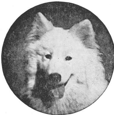
The White Christmas Sams