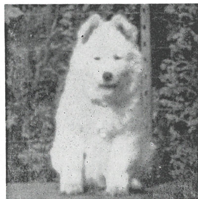
PUPPIES OF CHOICEST BLOODLINES