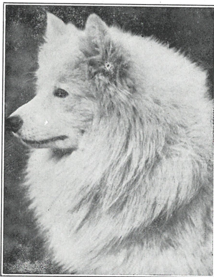
CH. STORM CLOUD Ch. Sea Foam ex Ch. Vara Imported by Elizabeth Hudson, 1930

remain in coat creditable enough to show them at all but short intervals of time. A bitch moults more frequently and then after puppies, go completely out of coat—so they are under a great handicap).