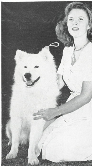
Murdock's Eyak of Petsamo with Shirley Temple