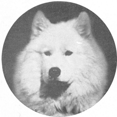
CH. NOVIK OF SNOWLAND BREEZEWOOD SAMOYEDES