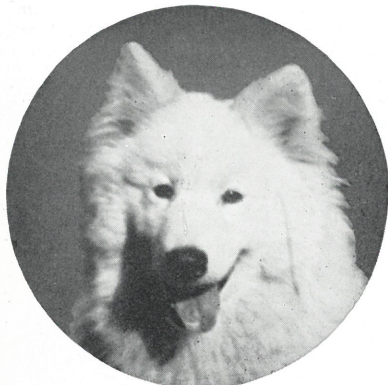
The White Christmas Sams

Snow Maiden of Snowland Kara Kobe of Oceanside Lensen's Snow Chief