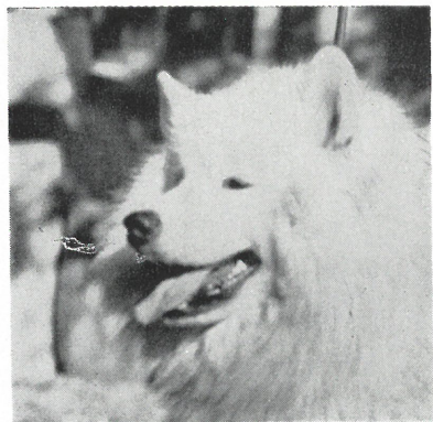
ADA OF SNOWLAND