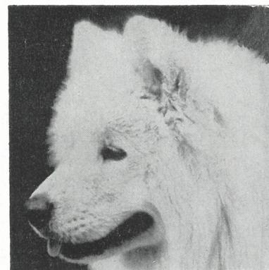
DEYOMAS OF IBUR