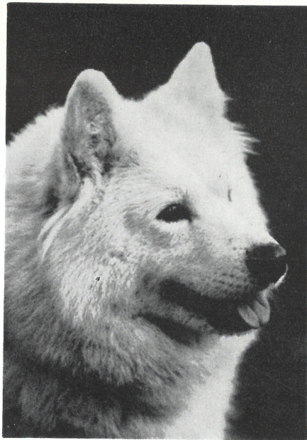
English and American Champion Princess Silvertips of Kobe