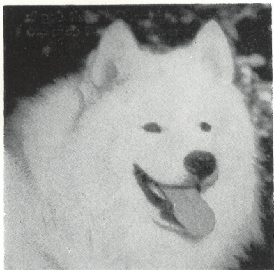
IRISH AND AMERICAN CHAMPION SNOWLAND STARA