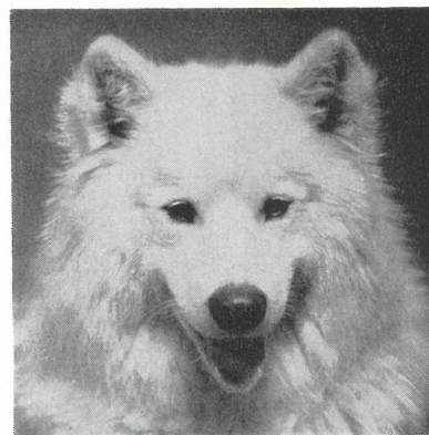
CANADIAN CHAMPION SPARK OF ALTAI