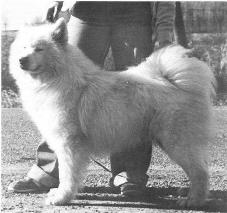
Ch. Nepachee's O'Henry

was perfect, but carried good qualities. Now we are starting to line them with several different lines.