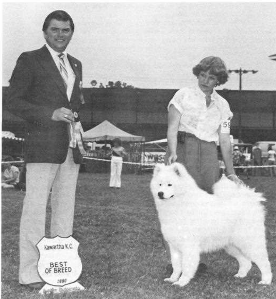
Nepachee's Music Man, CD

Take your time, don't be in a hurry to get into a breed. I know that people just don't pay attention. They rush out and buy. There was an article in one of the Dachshund magazines a while back, about a woman who had taken five years before she brought her first Dachshund. She spent that time going to shows, talking to breeders, reading books, researching, and she ended up producing some of the best