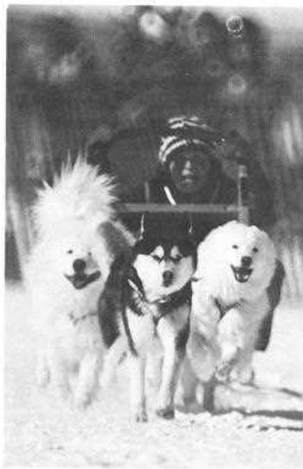
Ch. Gol'Chikha of Nepachee and Can. Ch. Nepachee's Stormy Silver Flair, Can. CD.

definitely an asset in the North, but to work in this area with wet snow, you would have to trim it. This is what a lot of breeders don't understand. You have to cut it back, and you have to vaseline the feet, otherwise, they snowball.