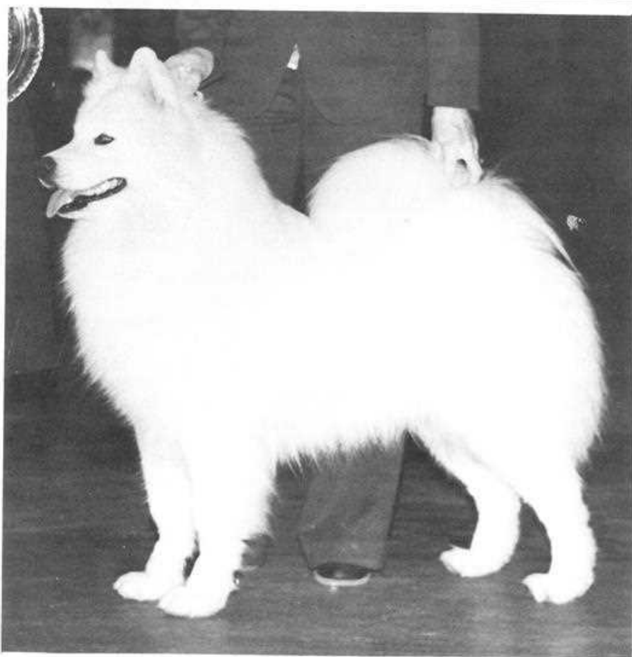
Ch. Gol'Chikha of Nepachee, CD

Non-breeder judges think Sams are white. It is a rare dog that is totally white as most of them have biscuit some place on them. We have had