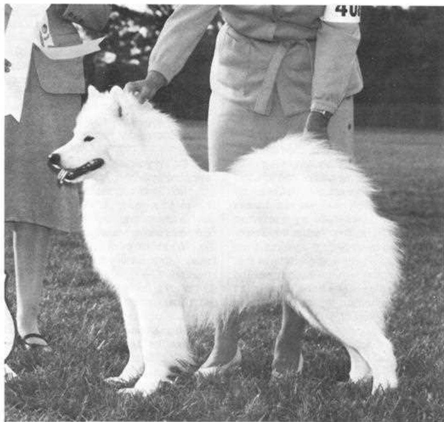
Ch. Nepachee's Excaliber