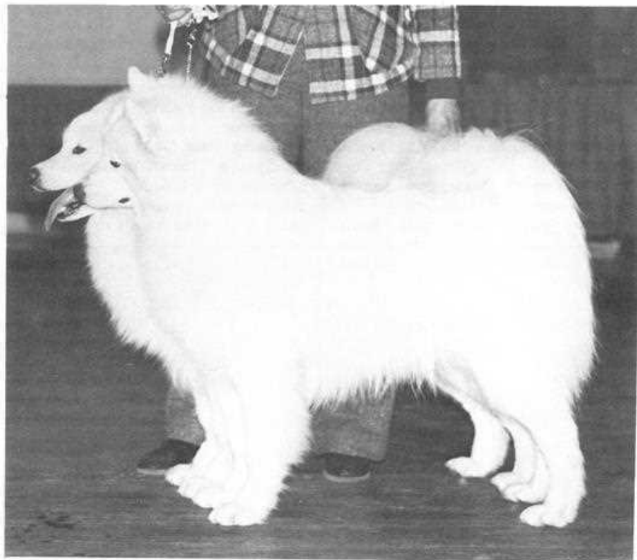
Ch. Gol'Chikka of Nepachee, Can/Am CD and Ch. Chiendar's Nepachee Avenger

Yes, they are excellent places. Look at the dogs and if the best one