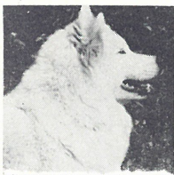
Lensen of White Christmas

(Ch. Borealis of the Far Steppes ex Dragoya of Wimundstrev)