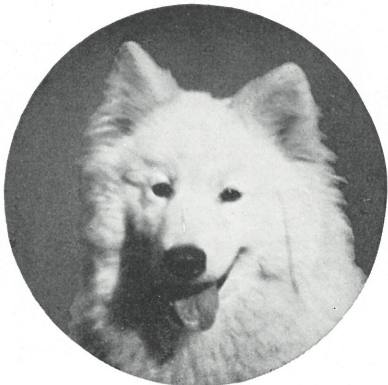
The White Christmas Sams

Snow Maiden of Snowland Kara Kobe of Oceanside Lensen's Snow Chief