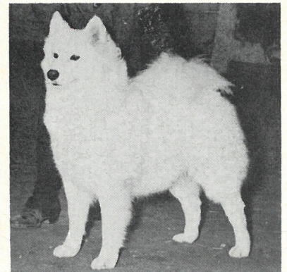
Ch. Tempest of Misty Way (B)

OFFER FOR SALE Choice Puppies — Both Breeds