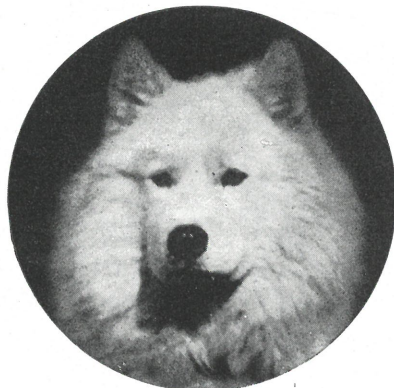
Ch. Novik of Snowland