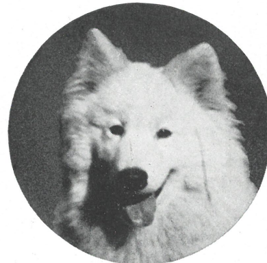
The White Christmas Sams

Snow Maiden of Snowland Kara Kobe of Oceanside Lensen's Snow Chief