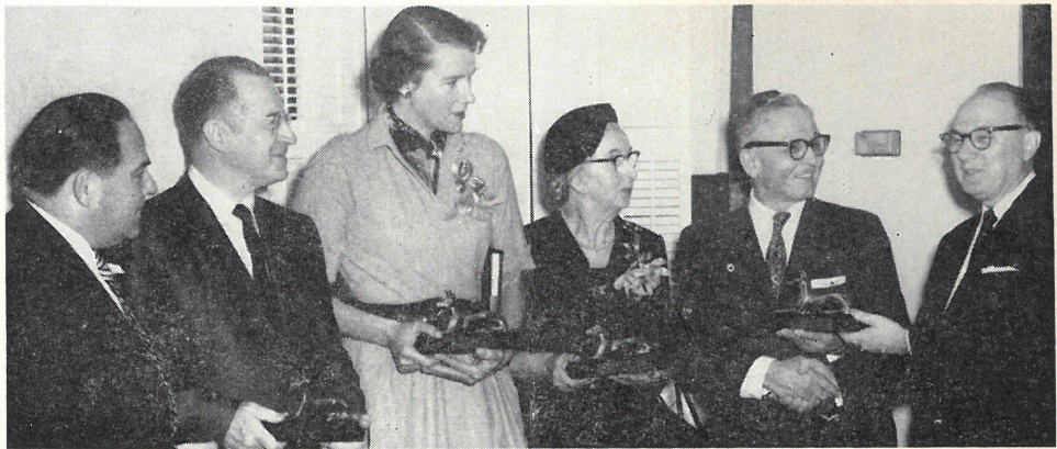
WINNERS OF GAINES' "FIDOS"

P. O. Box 1362 DA. 2-9076 Palo Alto, Calif.