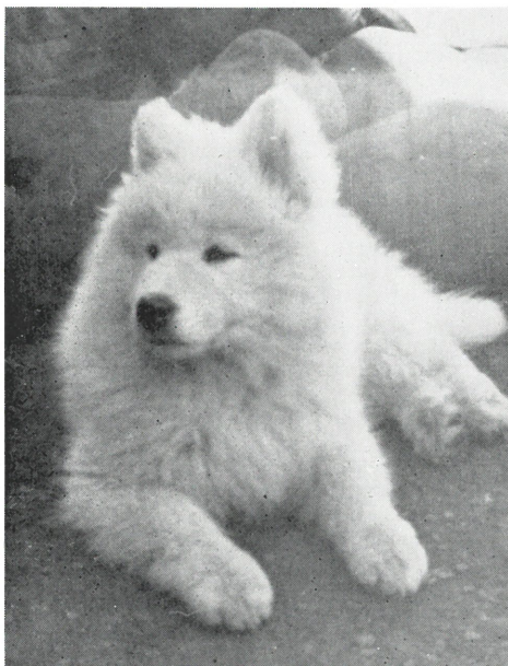
Strazha—A Beautiful Son of Guardian of The Arctic ex Belinki