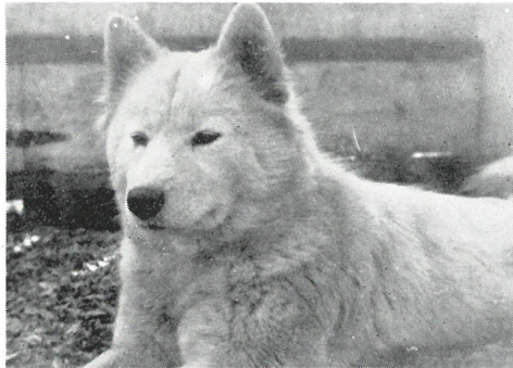
"WHAT'S MY NAME?"