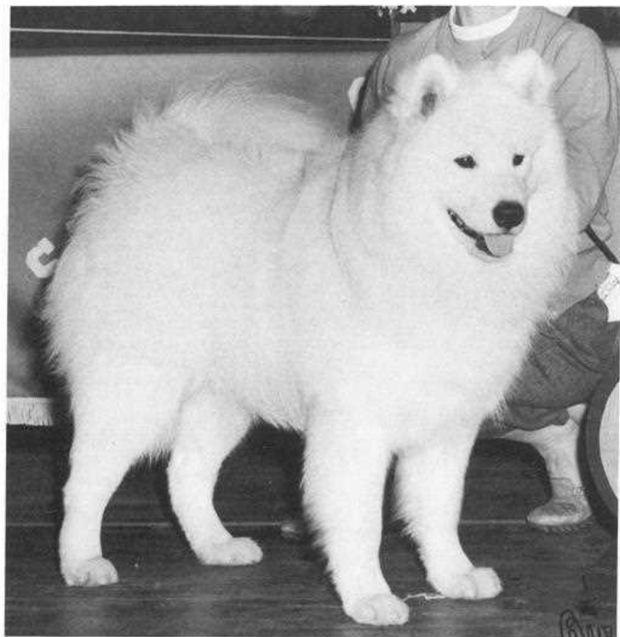
Ch. Wynter Kloud of Silver Moon at 9 months going BOW for a 5-point major, first time shown.

Yes, I sure did. There was one that wouldn't X-ray and I said, no. Another one, the bloodlines just weren't right - it was a mixed breed - and I said, "I'm sorry, I can't accommodate