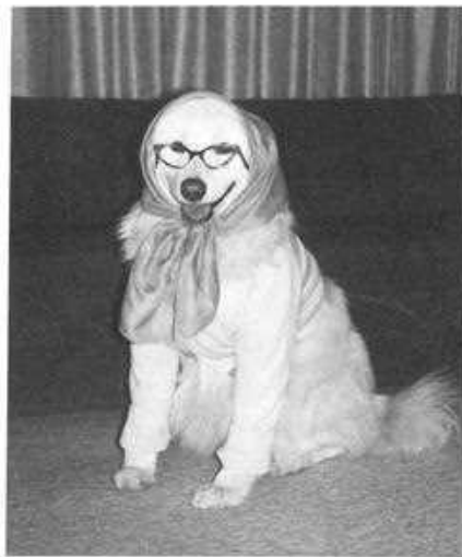
Ch. Duchess Joh-Ni of Silver Moon at 10 years.

Yes. In New Jersey I worked in the emergency room of St. Joseph's Hospital in downtown Patterson, New Jersey. That was a whole different world. The dog shows were so different back on the East Coast than they were in the Northwest, which were more casual. When we first started back into dog shows all of these were benched shows, and more formal. There were so many shows. If you didn't like the judging panel at the shows over here, you could go 50 miles the other way. When we first moved here and went to the dog shows, they were so casual. In a way, it was nice to go from one part of the country to another because it was a learning experience in dog shows.