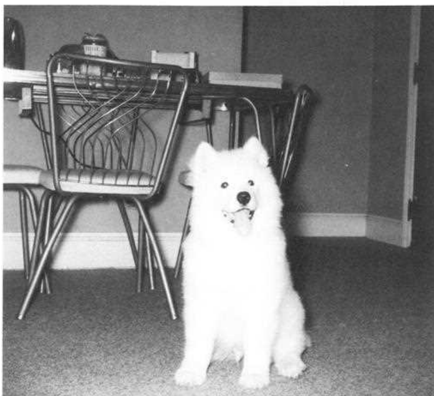
Ch. Wynter Kloud of Silver Moon, "Kloudi," at 11 weeks.

puppies and very definitely when whelping. They do need that. The mother's milk is better and the puppies feel much better, too. I believe in supplementing, yes.