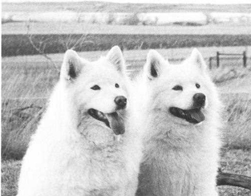
Left: Ch. Wynterkloud!'s Patyna Sno Mist (Kloudi's aunt).

No, I don't. If people want to do that, it's OK, but if a dog has the proper diet, their coats are going to be what they should be. You can use a little oil in their food and it will come out in their coat. If you feed them properly, you don't have to put all this substance on those dogs. I don't believe in it and never have. A lot of people used to use spray and all that and I won't. As far as I'm concerned, when my dogs are groomed, they will be groomed the way I've been taught to groom and no artificial substances put on them. Some-