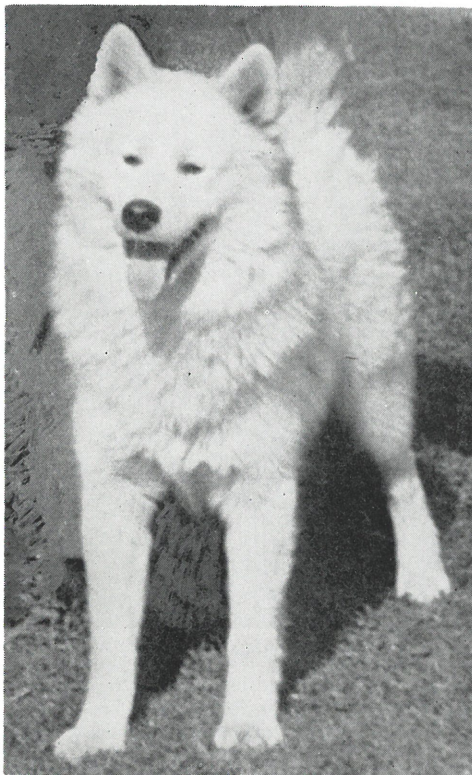
Raicer Suraine of Brentwood, son of Ch. Suzanne of White Way and Ch. Rainier at Six months

in a marvelously hand-written letter) tells us of her enjoyment of the Christmas WKW—and her delight in seeing the picture of her