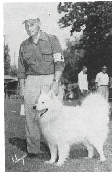
CH. SAMOYLAND SERGEI