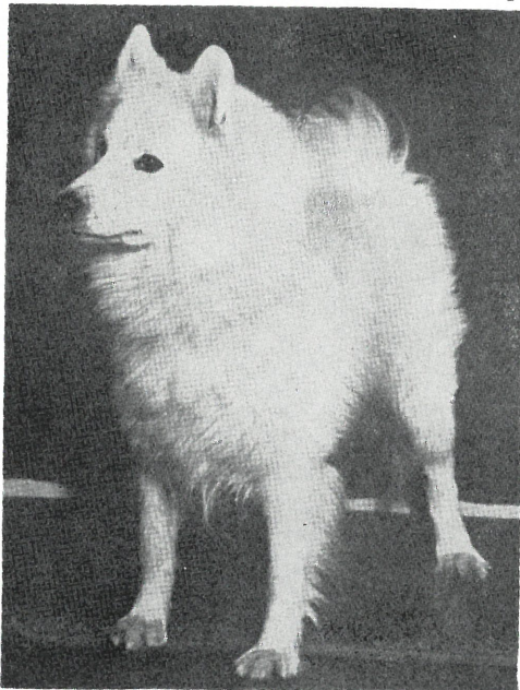
WHAT'S MY NAME?