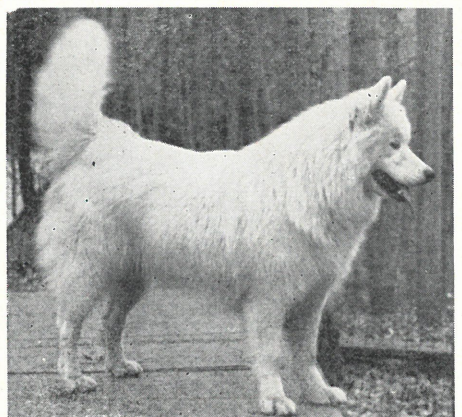
SNOWLAND KEENA FROST SAMOYEDS of SNOW SHOE HILL Puppies Occasionally, Selected Breeding JULIET T. GOODRICH Land O'Lakes -:- Wisconsin