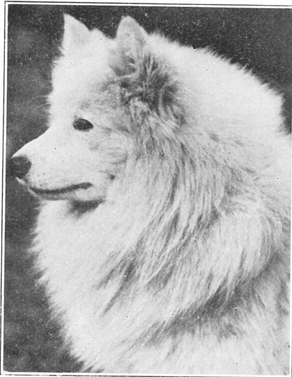
CH. STORM CLOUD