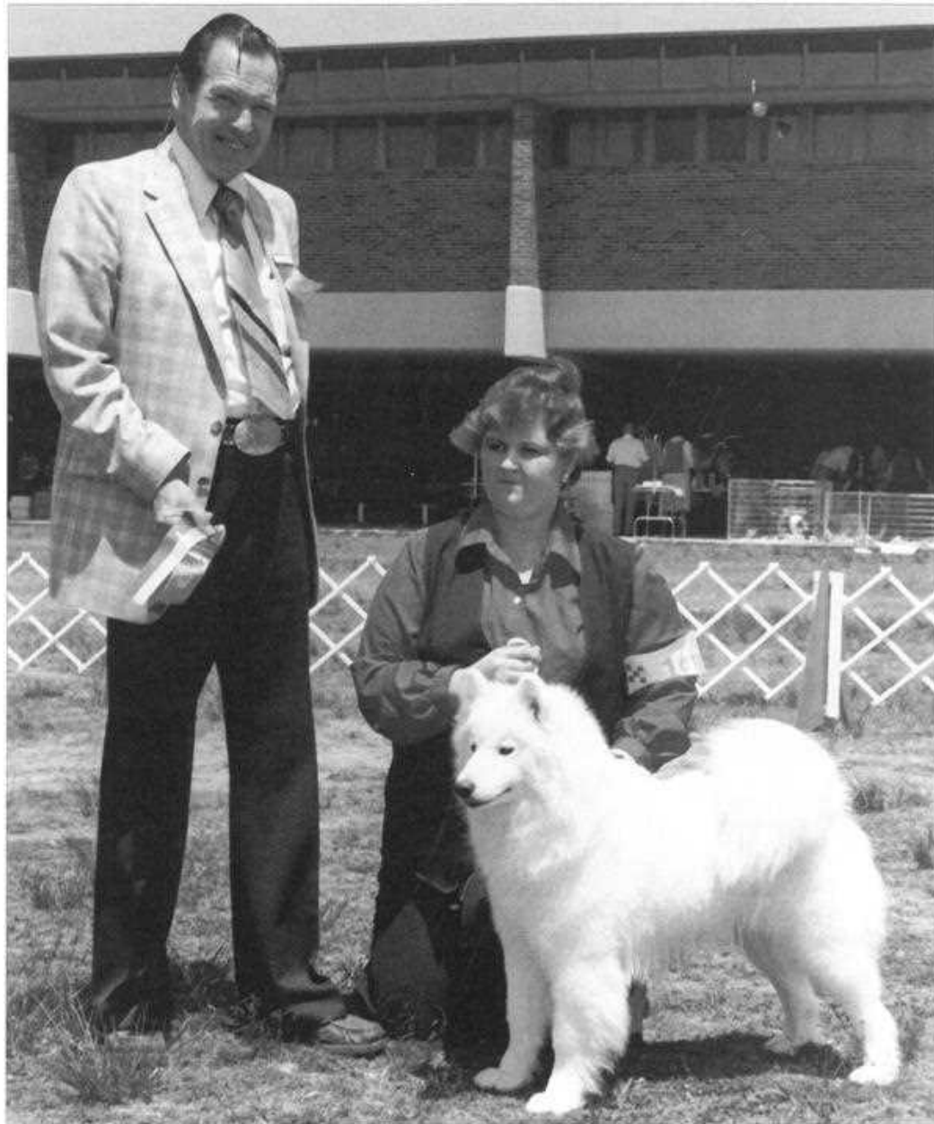
Ch. Timberline's Sugarbear.

Also, when we were talking about economy of motion, it ties into the food thing. In their native element, these dogs had to operate on so much less food. They had to be able to deliver more return per ounce of energy expended in order to survive; it was simple survival. They had to be very efficient in their digestive processes. As such, our dogs have a much lower metabolism than most other breeds. So they gain weight if you even look at them! Cream cheese is my secret weapon in giving medicine, because they don't try to chew