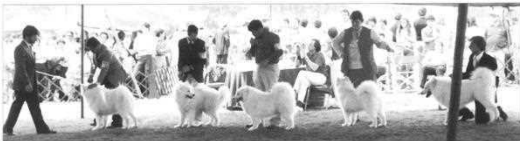
Second from right, Am/Mex/PR/SA/Int. Ch. Homeland's Sumi Side Up, "Daisy."