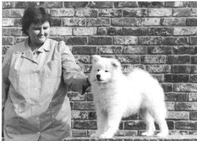
Homeland's El Niño Nevado, "Amigo," a Daisy son.

Also, buying a dog to breed especially right out of the chute as a new breeder is a bad idea. I believe you ought to go through a pet or two and really get to know the breed first. Not necessarily a pet quality, but buy a dog to show and just to live with, and don't plan on breeding it immediately the minute they turn two years old. Take your time and get to really