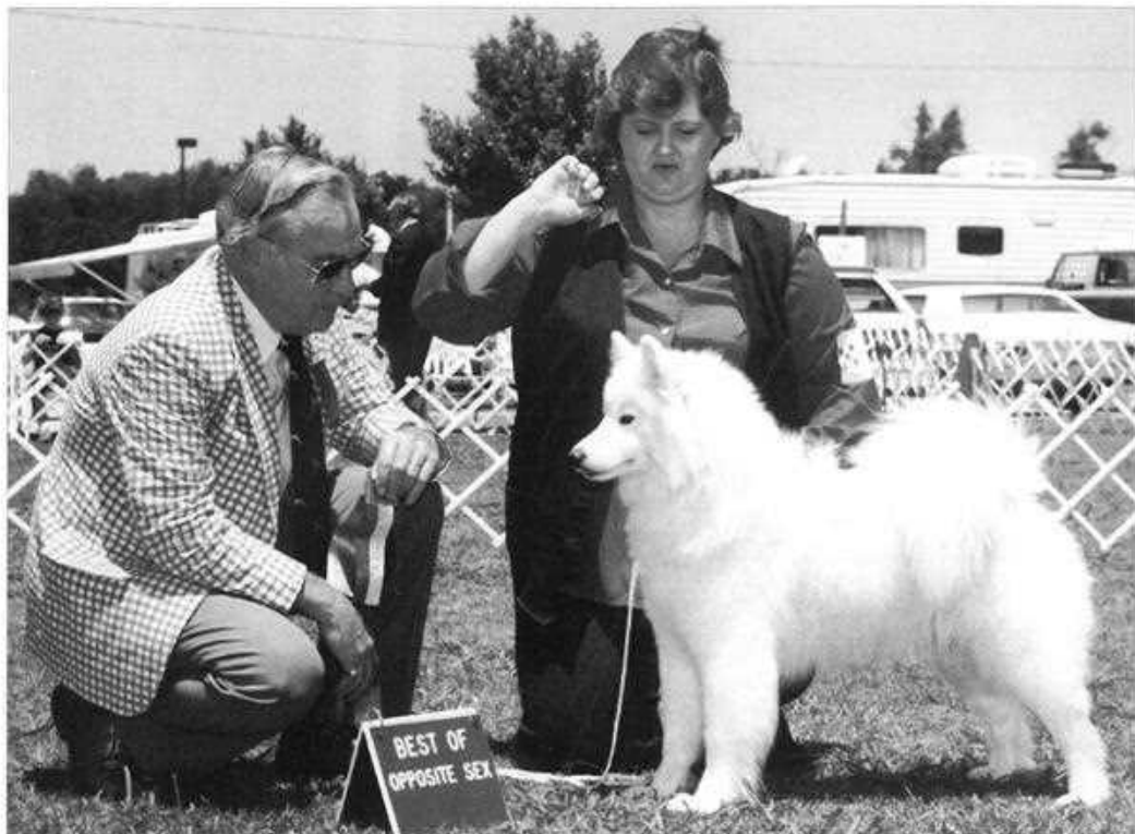
Ch. Timberline's Sugarbear.