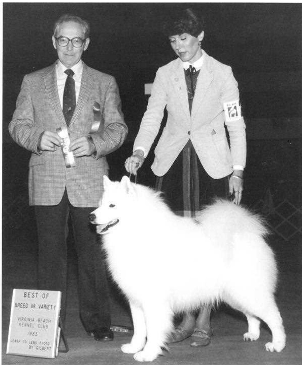
Ch. Homeland's Original Recipe, "The Colonel" (Sugarbear x Lynthea's Star-Studded Knight).

My breedings have all been natural. So have the whelpings; there has never been an artificial insemination or a c-section. I have been very fortunate in that