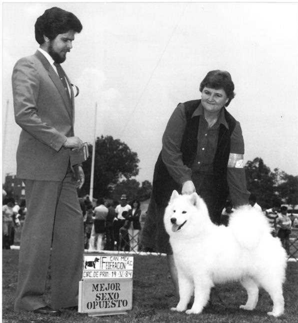
Am/Mex/PR/SA/Int. Ch. Homeland's Sunni Side Up, "Daisy."