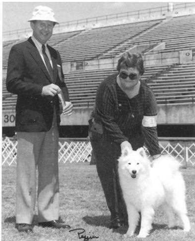
Ch. Timberline's Katy Homeland.