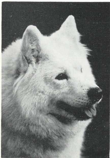
English and American Champion Princess Silvertips of Kobe