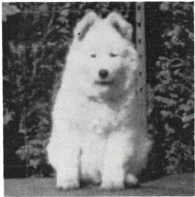
PUPPIES OF CHOICEST BLOODLINES