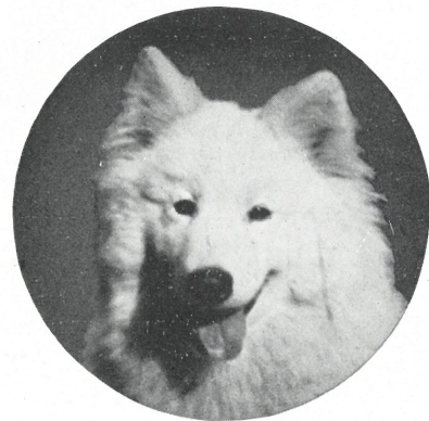
The White Christmas Sams