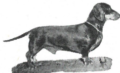
Ch. Smokey of Lindell

Known for Over a Quarter of a Century for Good Sound Breeding Studs - Puppies