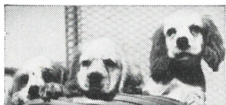
Hundreds of healthy litters, the offspring of dogs that have been fed Friskies for generations, have been produced at the Friskies Research Kennels.

Such treatment has proved to be most successful at the Friskies Research Kennels. However, any eye condition which does not respond rapidly should be treated by a veterinarian.