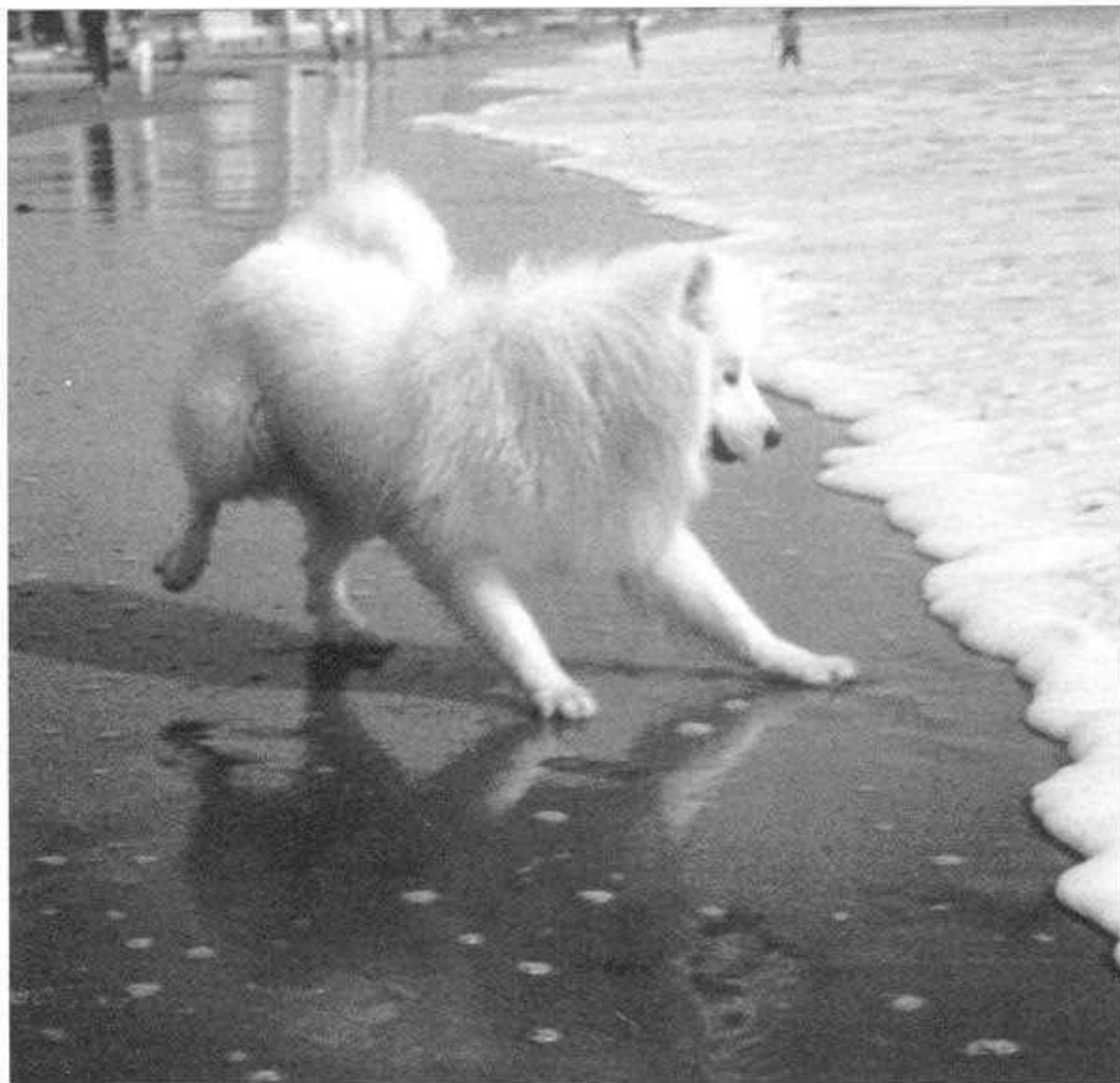
Frost River's Omar of Orion on the beach, 1968.