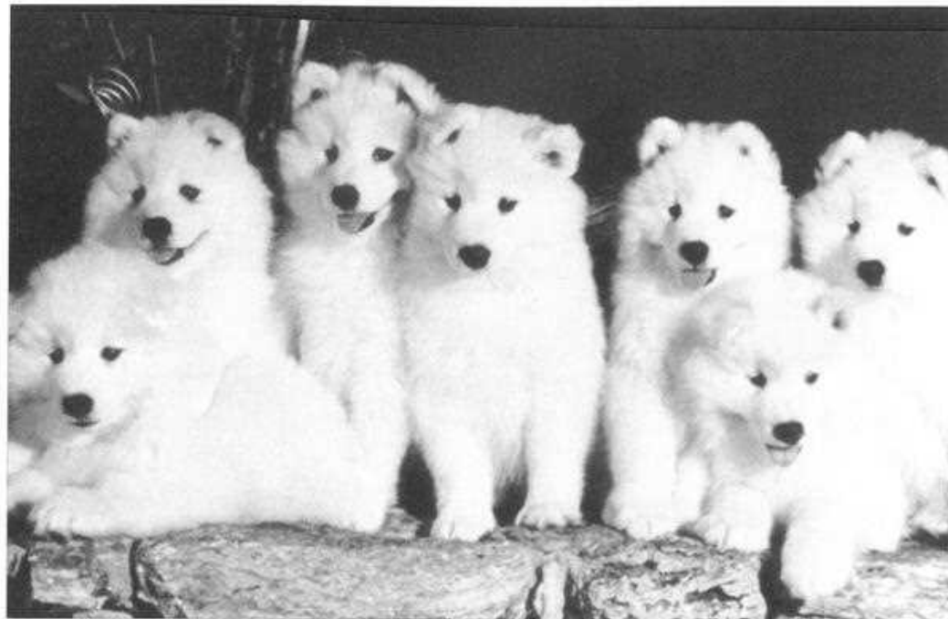
An Orion-bred litter of eight-week-old Samoyed puppies, 1990.