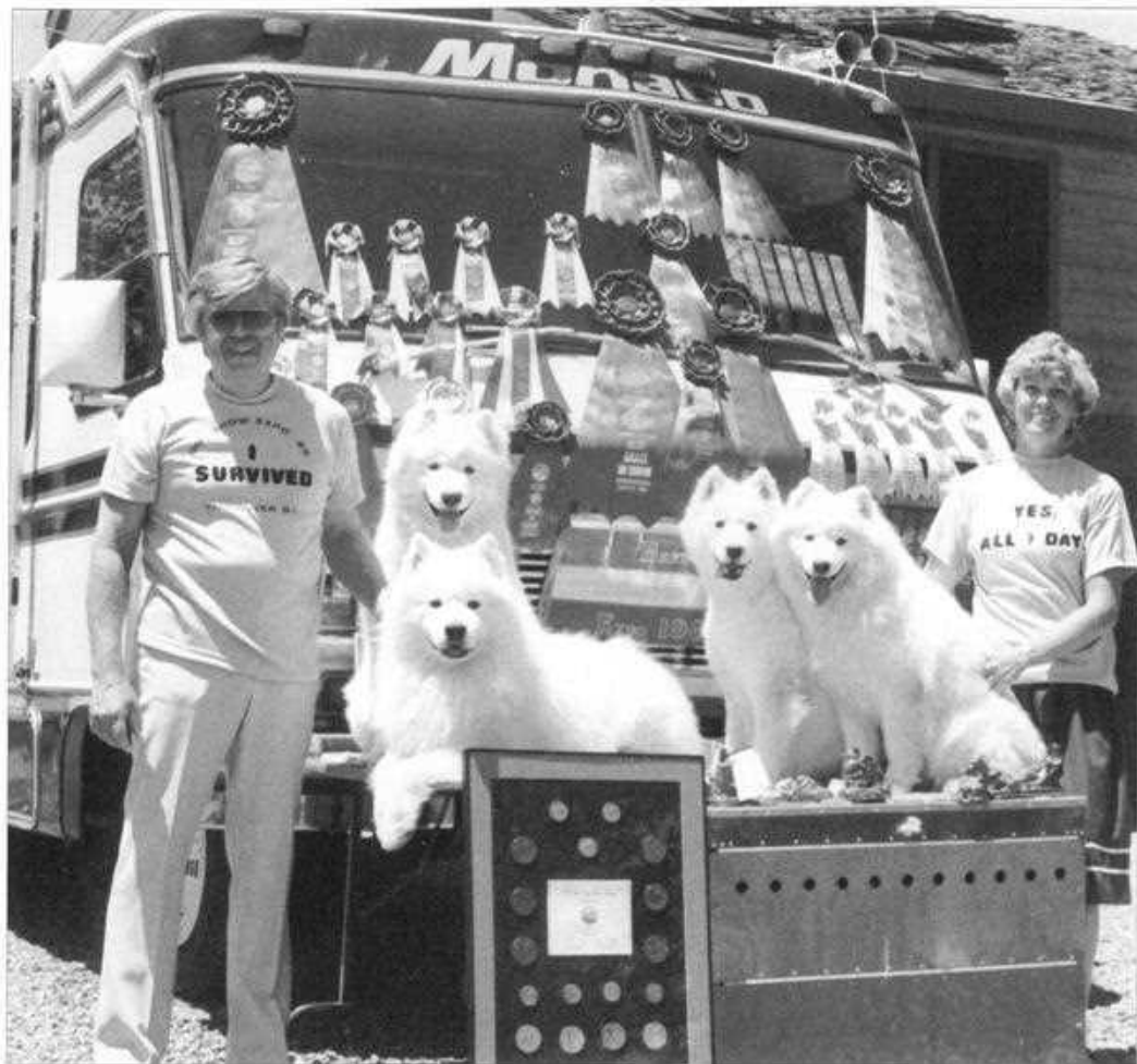
These four dogs collected seventeen medallions, two finished championships, two started, Dog Show Society show at Canada's World Fair at Expo in British Columbia, 1986.