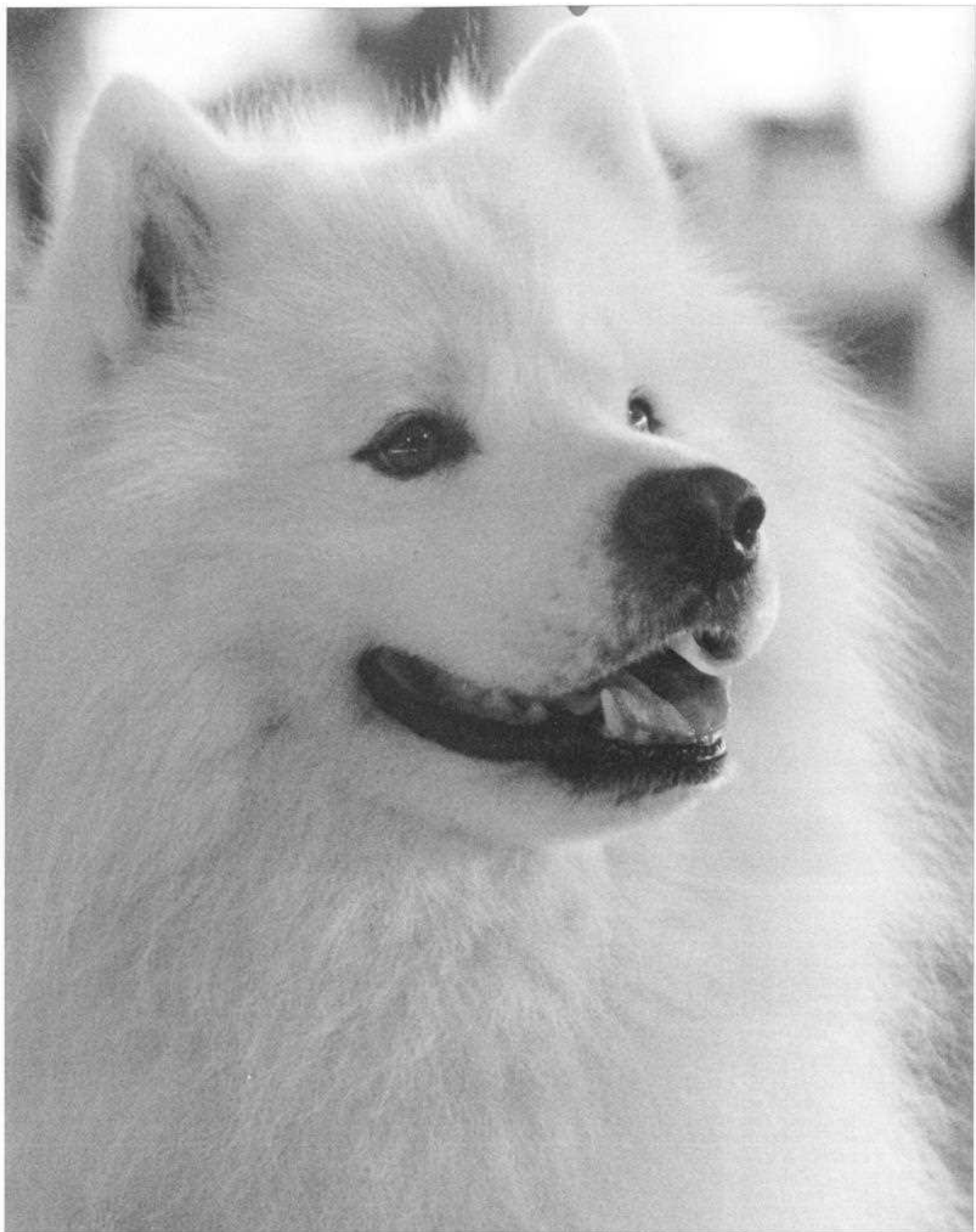
Am/Can/Mex/Int Ch. Sansaska's Omarsun of Orion, BIS, "Omi."