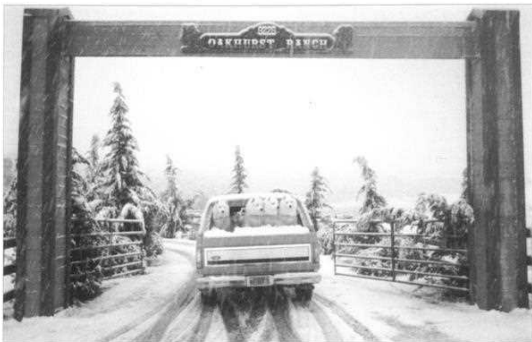
Four of the Orion champions on the way to their morning "dog jog."