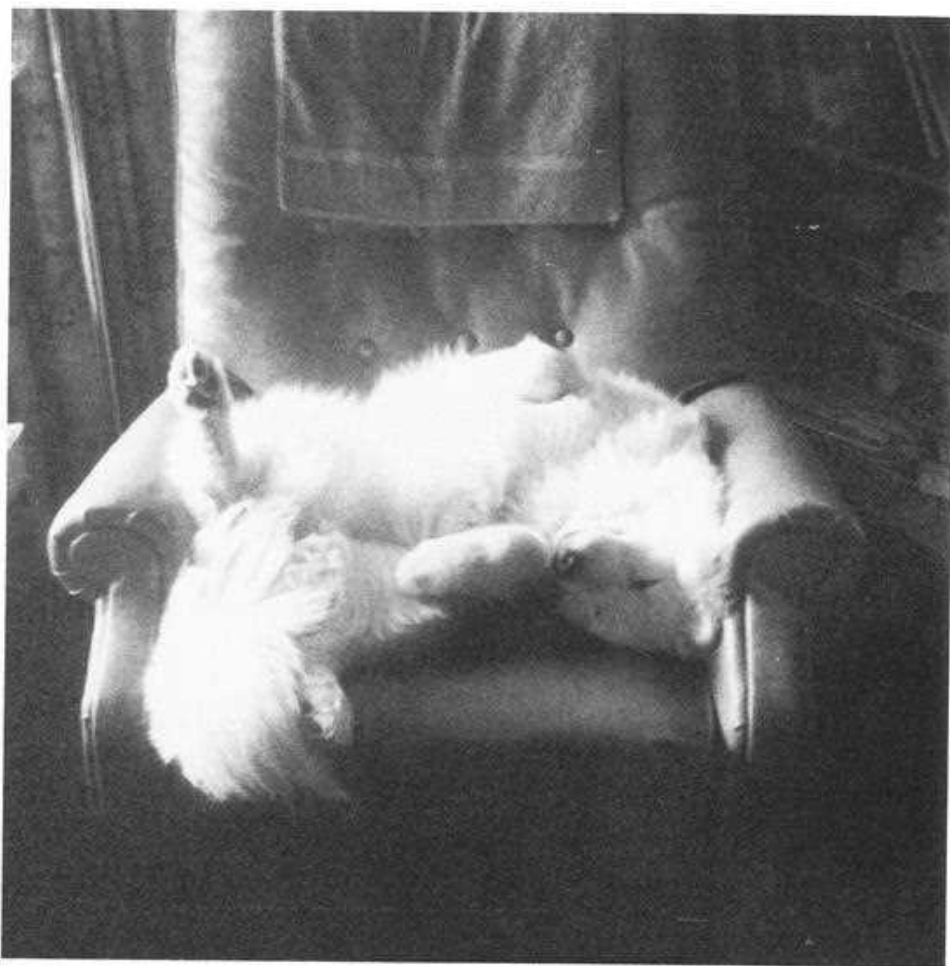
A comfortable snooze.

It's very difficult to go into an area where somebody who is a judge is doing a lot of breeding and exhibiting and walk in the ring against this same person who shows under