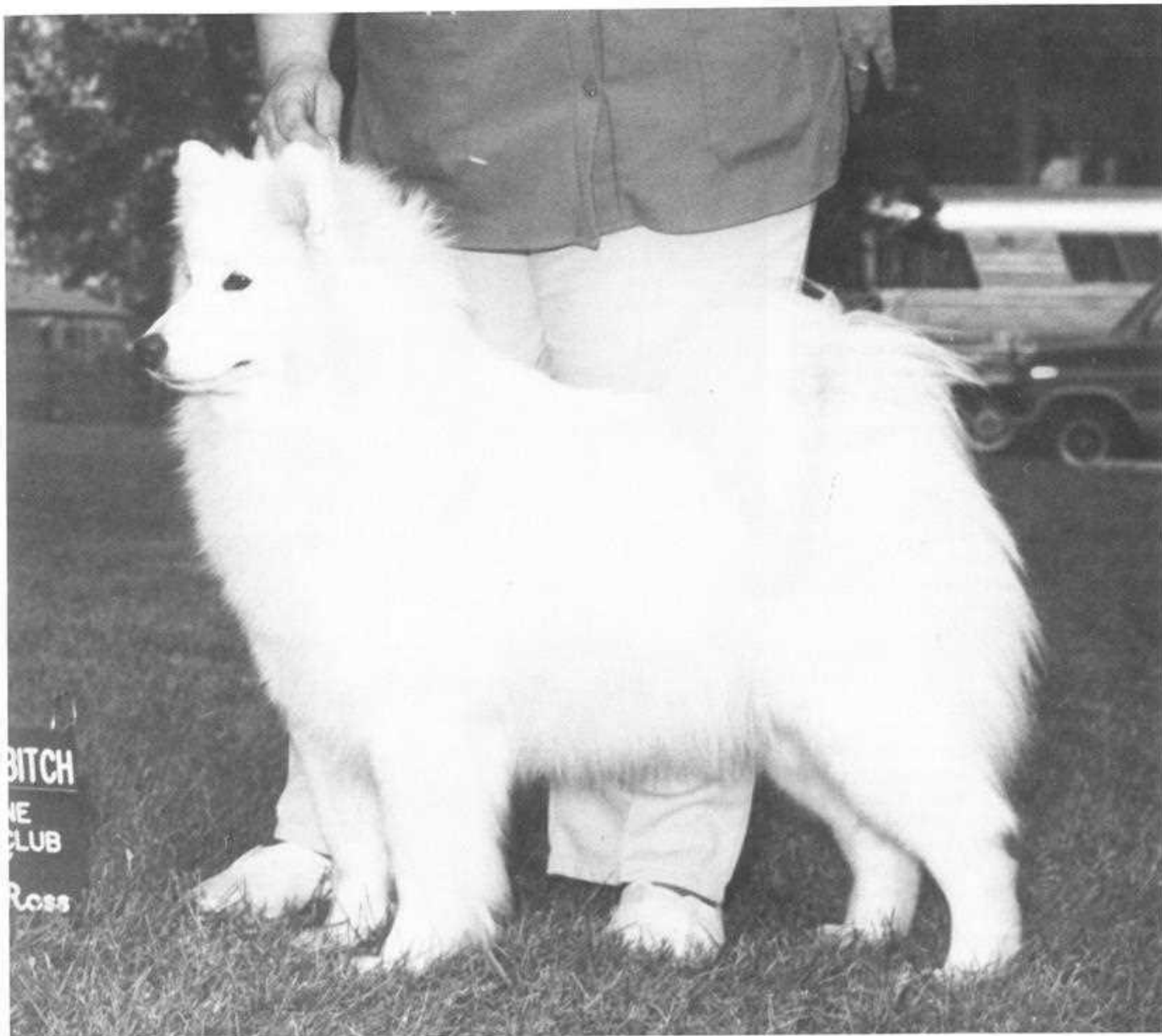
Am/Can Ch. Co-Lee's Klassic K.

Other than what I've mentioned, I don't usually use supplements. I have a couple of them on zinc supplements. Of course, when they are pregnant, I supplement.