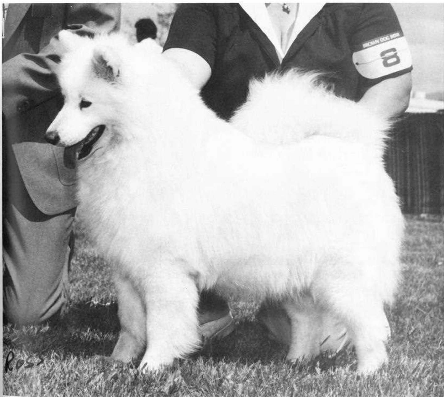
Am/Can Ch. Kalmari's Aloha Tehani.

They do. One of these vets died last year and another retired; two of their daughters finished their degrees at the university and came back and bought into the clinic, so they are now running it with one of the older partners. We've always been very lucky over the years. They will come out to my place here so I don't have to make four or five trips down and move dogs in and out of crates in the van and so forth just to get