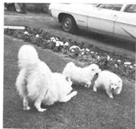
Ch. Saroma's Snow Beauty O'Vellee (Neena)