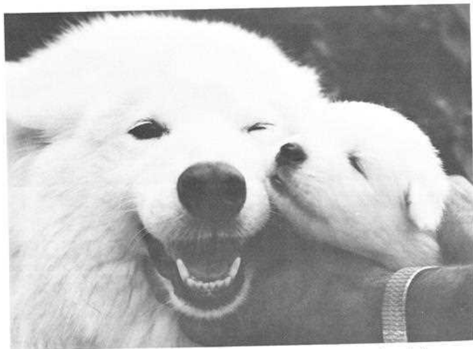
Ch. Pinehills Sugar of Snowblaze and puppy, Gebba Snowblaze Almond Sugar.

No, I think the older they get the more the price would be if you definitely feel that they're going to be and know that they're going to be show quality, then you would price them