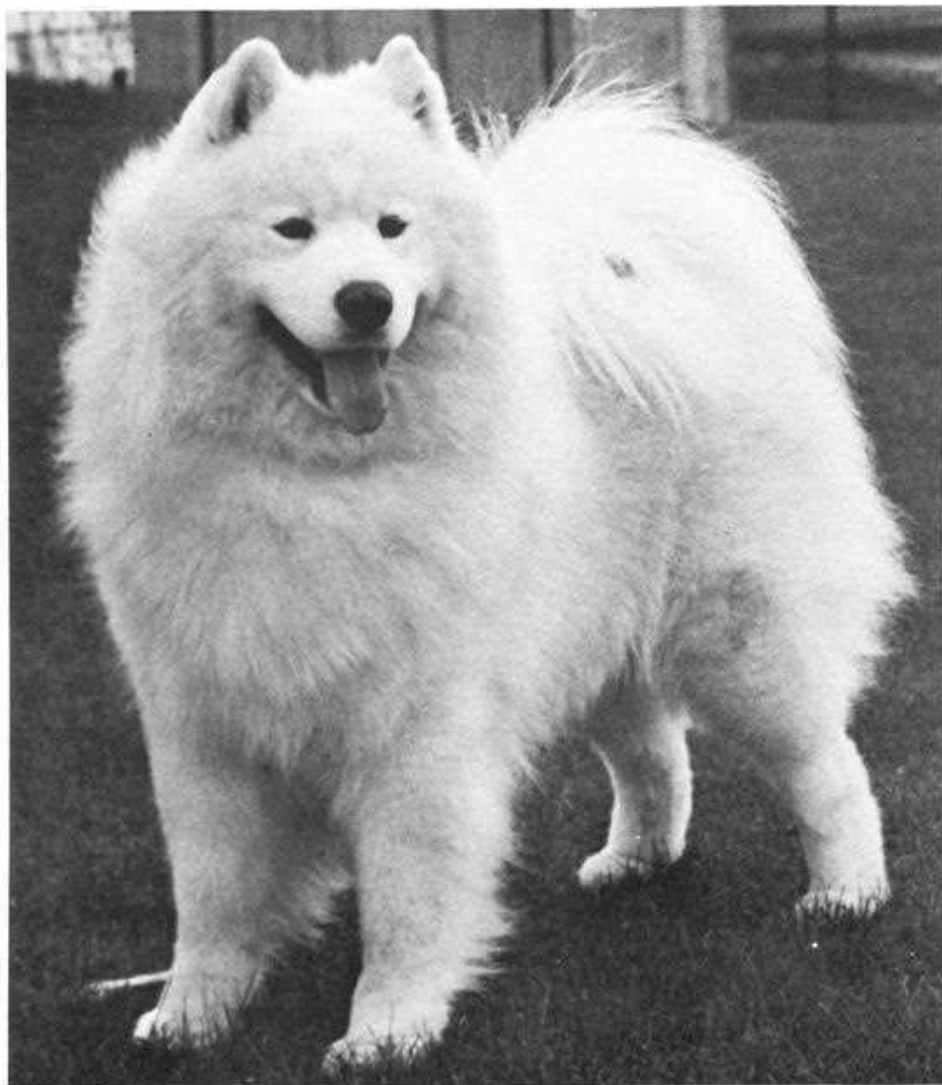
Ch. Veltie's Joli Sparkle of Life

No, you know, that's really strange, the people that have come here with pedigrees when I would see them, there was always a tie in, when it was just pet quality.