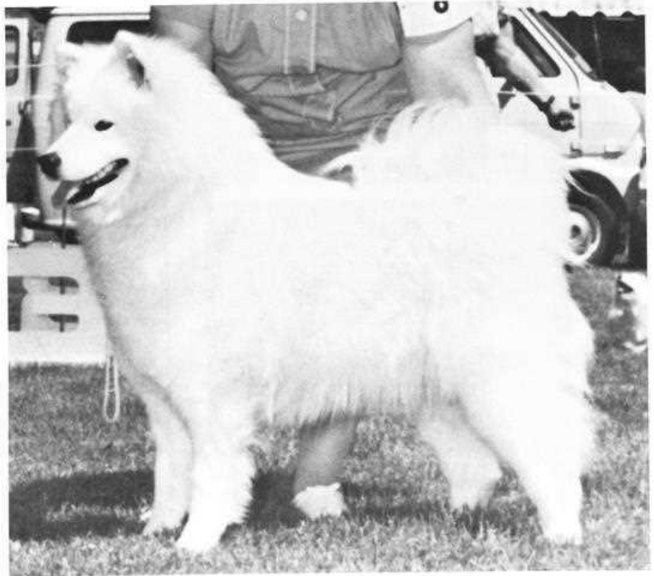
Ch. Vellee's Silhouette

Going back to Joli Kaluna, old Ruff as we called him, big Ruff and the young Ruff we called little Ruff; it should be reverse because little Ruff was actually larger than big Ruff. When Ruff was coming home after a show we would drive over the hill and