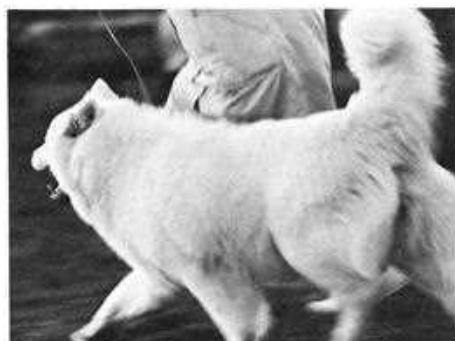
Ch. Vellee's Chayka

A beautiful bitch that took the points, I can't remember the bitch's name right now, but she was a littermate to Ch. Noatak of Silver Moon. I know Chum was Winners Dog that day and finished his championship. But