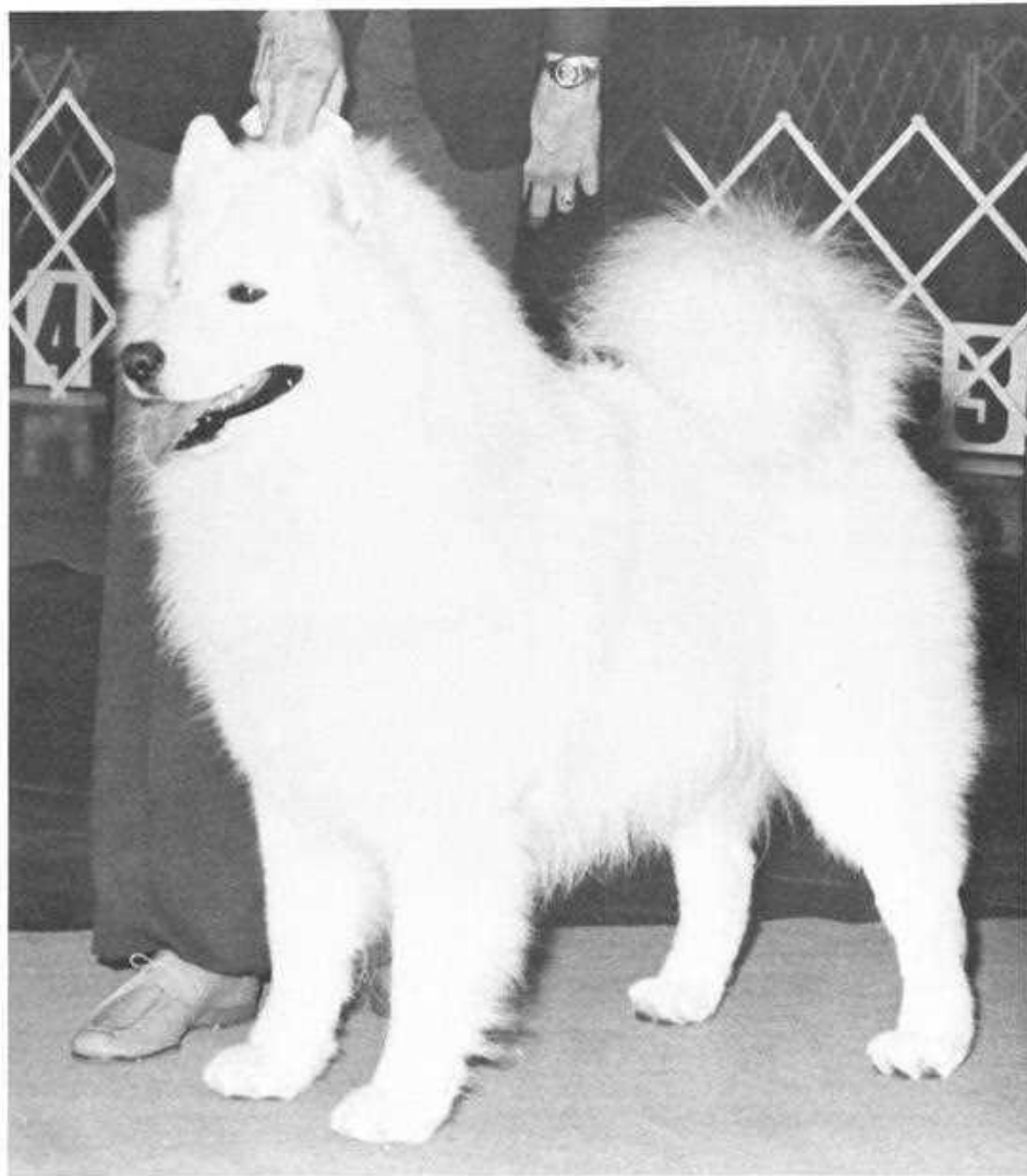
Ch. Christori's Tribute To Ruff

Not really. I think you used to more so than you do now. But people have bred back and forth, from here to there and shipped bitches to studs in all areas. I feel that the quality is pretty much the same all over.