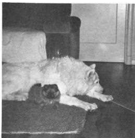
Neena and Pom puppy, April 1962