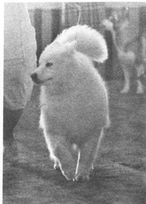
Ch. Vellee's Chayka

tion bitch, so we actually started with her.