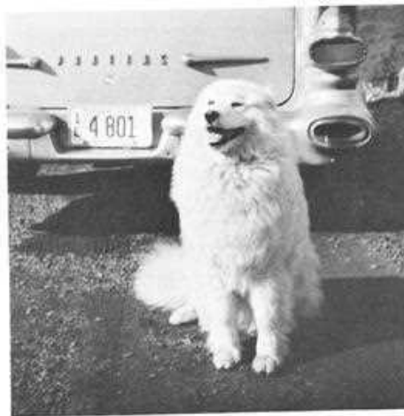
Kahmooks Kloshe Note soft ears -

Yes. Even the second and third generations. Because now out of Chayka we have Ch. Vellee's Silhouette and Vellee's Shadow. Shadow never completed his championship, he certainly should have, he was a nice dog but he hated the show ring, absolutely hated it. I'm sure you're aware how difficult it is to do anything with a dog that is constantly trying to get out of the ring. He wouldn't put any effort into his movement. Now here he was excellent and he was a good mover, with good reach, good drive, but he'd go in that show ring and drag. I actually could outrun the dog and I definitely can't run very fast. You just couldn't