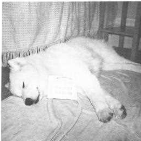
Ch. Joli Kaluna of Vellee

the statement "so-and-so has an eye for a dog?"