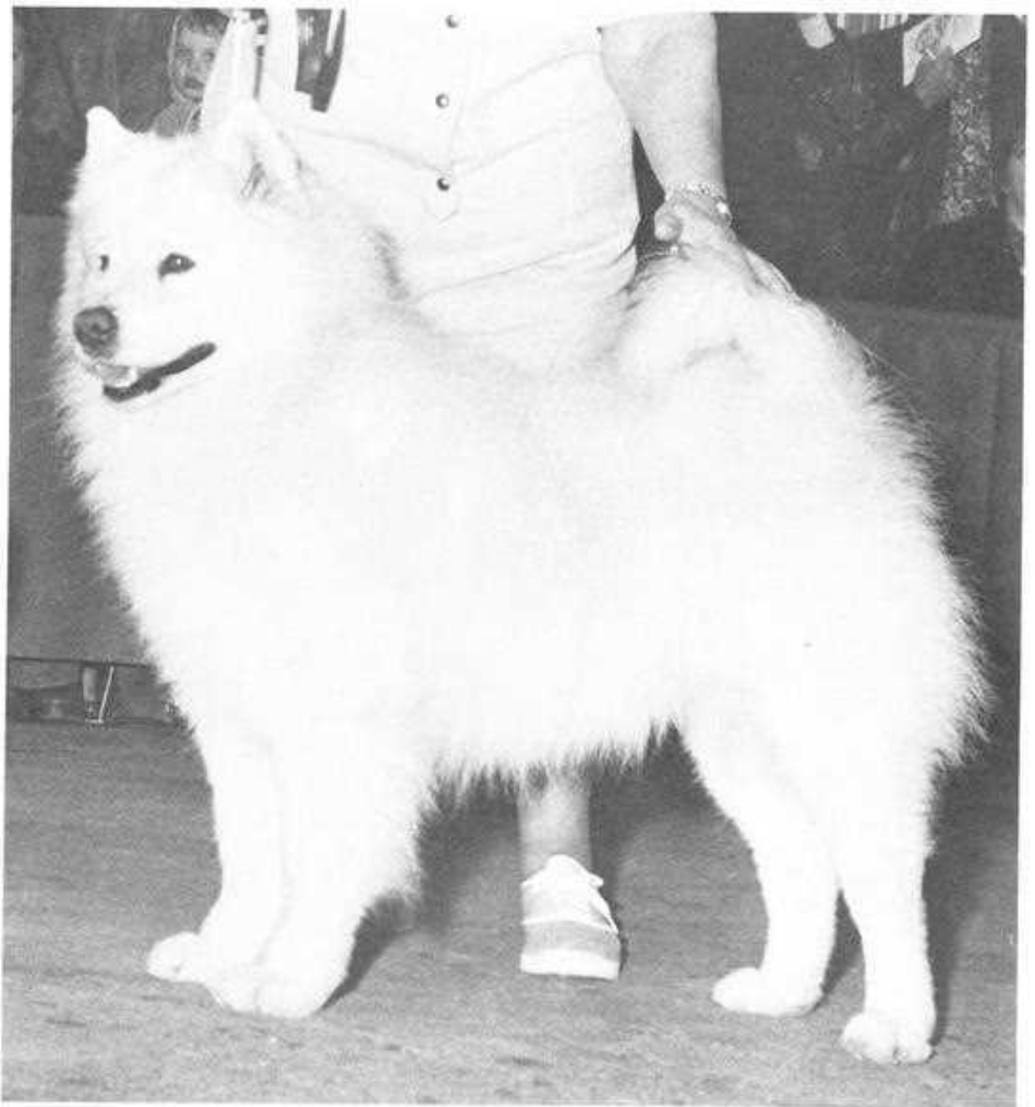
Ch. Joli Kaluna of Vellee at 11 yrs. of age.