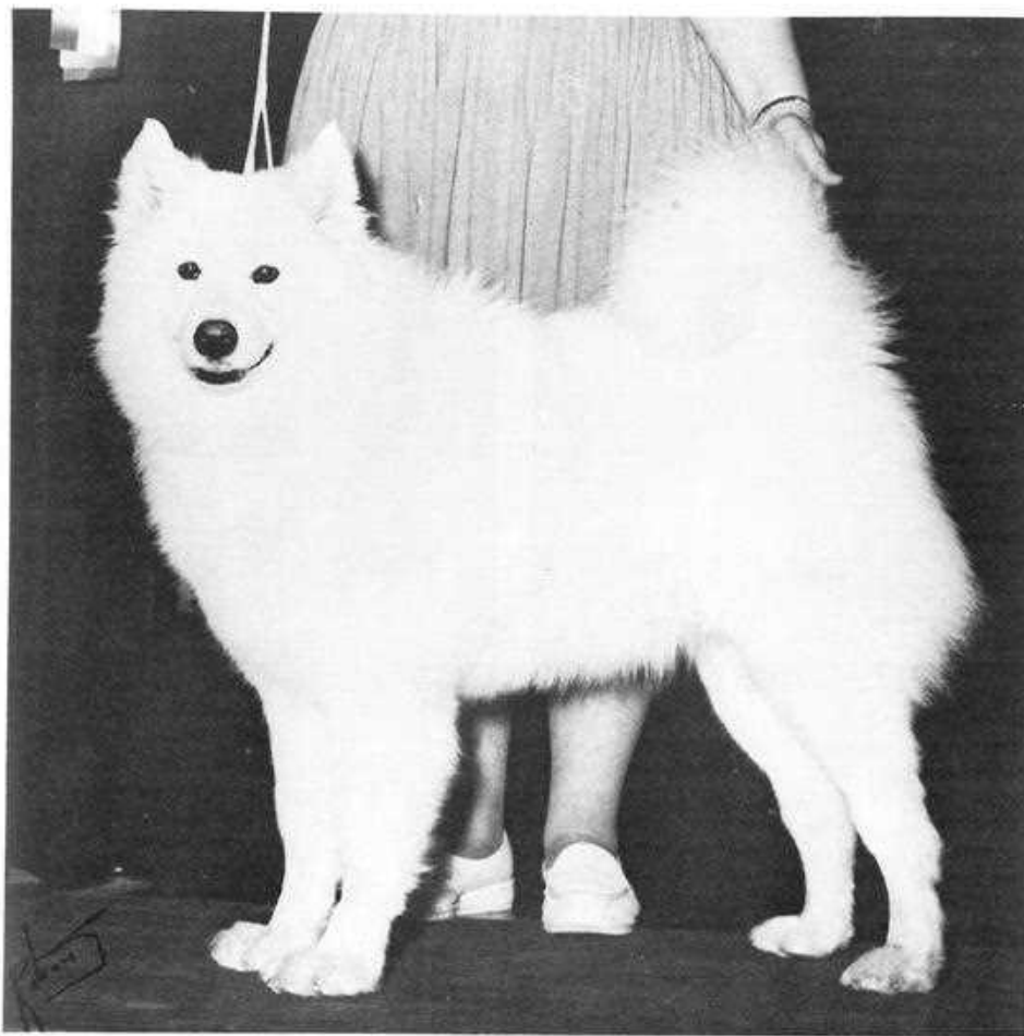
Ch. Saroma's Snow Beauty O'Vellee

Kahmook's Kloshe (Beautiful White Dog). We paid $25 for her, but she was registered and that was a big deal to us at that time. Her ears never came up; she had floppy soft ears. She didn't mind too well and was spoiled.