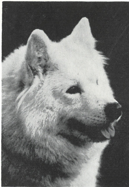
English and American Champion Princess Silvertips of Kobe