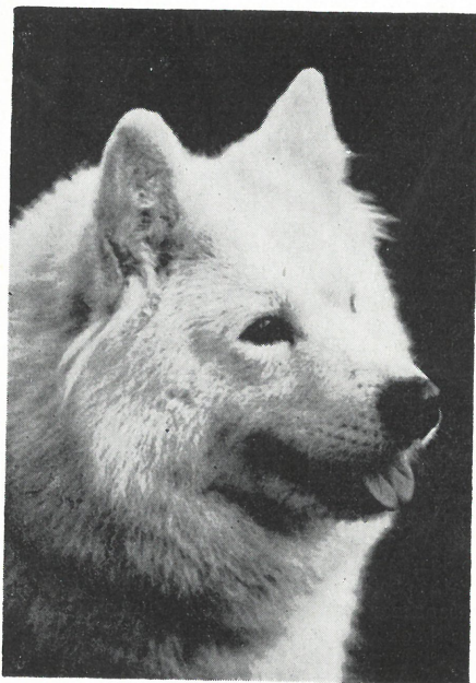
English and American Champion Princess Silvertips of Kobe