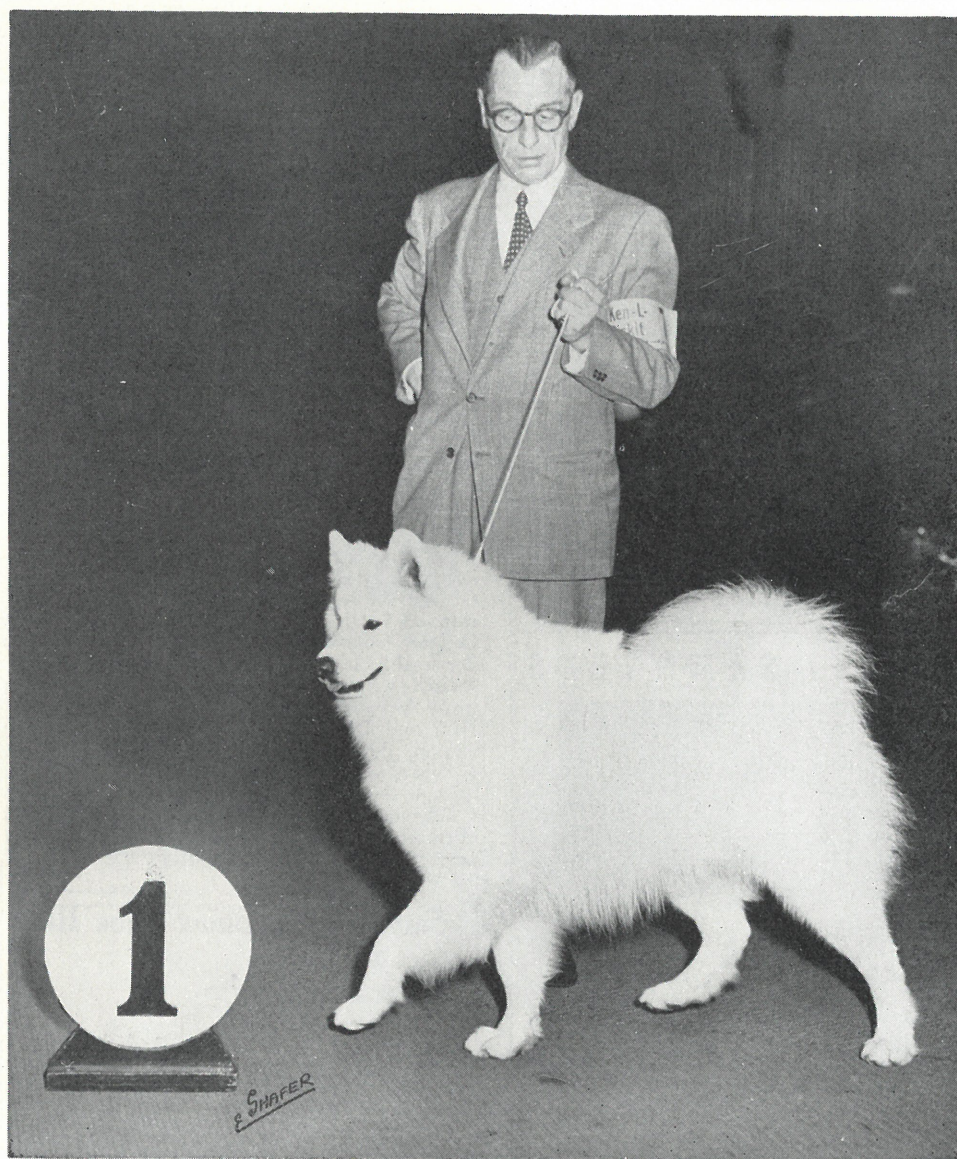
"The 4 Star Winner" CH. SILVER SPRAY OF WYNCHWOOD

WESTERN KENNEL WORLD 20 Sycamore St. San Francisco 10, Calif. (Sorry—No COD's)