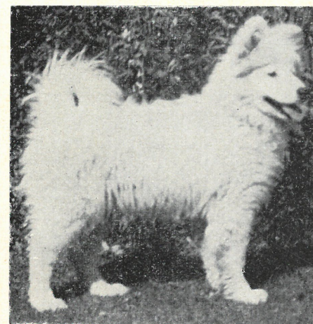
LENSEN OF SNOWLAND