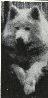
LENSEN'S SNOW CHIEF