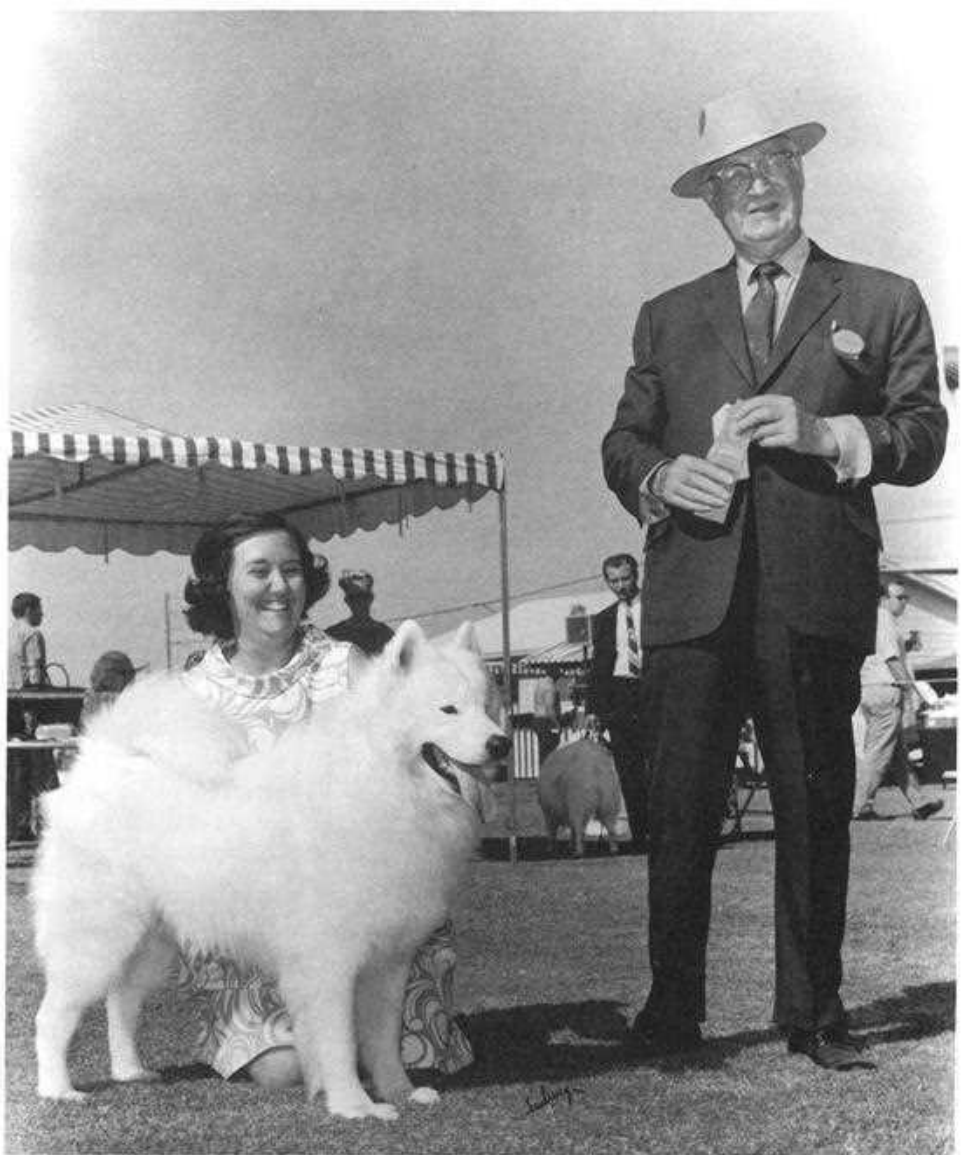
Ch. Sam O'Khans Kubla Khan.

It should be a hare foot, which enables the dog to walk on snow. It's not a round cat foot, and it certainly shouldn't be thin or splayed out. You see dogs now and again with their feet splayed. Part of the foot problem can be helped if they are on a correct surface. Deep gravel will help pastern or foot problems. There should be just a slight bend in the pastern and the feet should be tight. It is like a rabbit's foot that