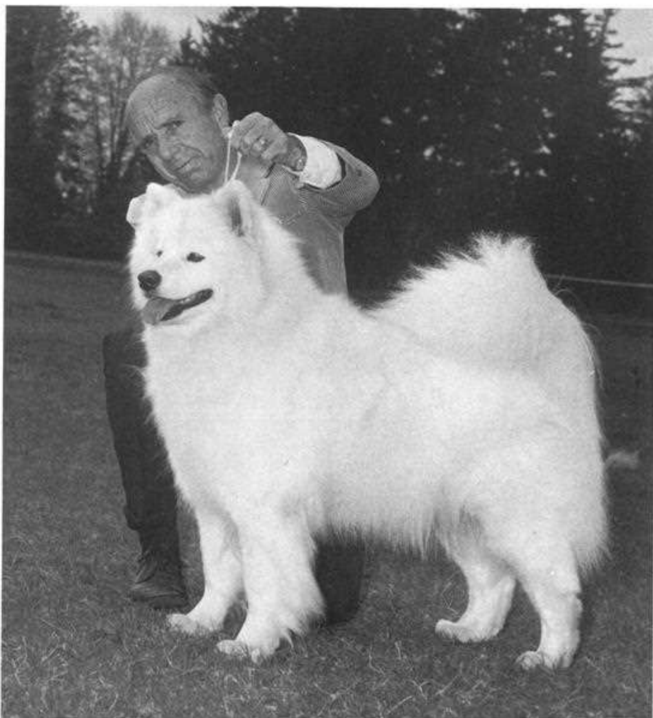
Ch. Scherezade of Kubla Khan.

something is to breed out once you get it into your line. If it is something difficult to breed out, like hip dysplasia, then you should be that much more cautious. You should look at not only the dog's OFA number, but the dog's background. If the dog is a terrific dog with something very strong in its background, then you might consider using a dog that is borderline as far as some breeding characteristic goes. Temperament is of prime importance in the Samoyed. If it doesn't have the correct temperament it is not a Sam. After all, puppies need to be good family members first.