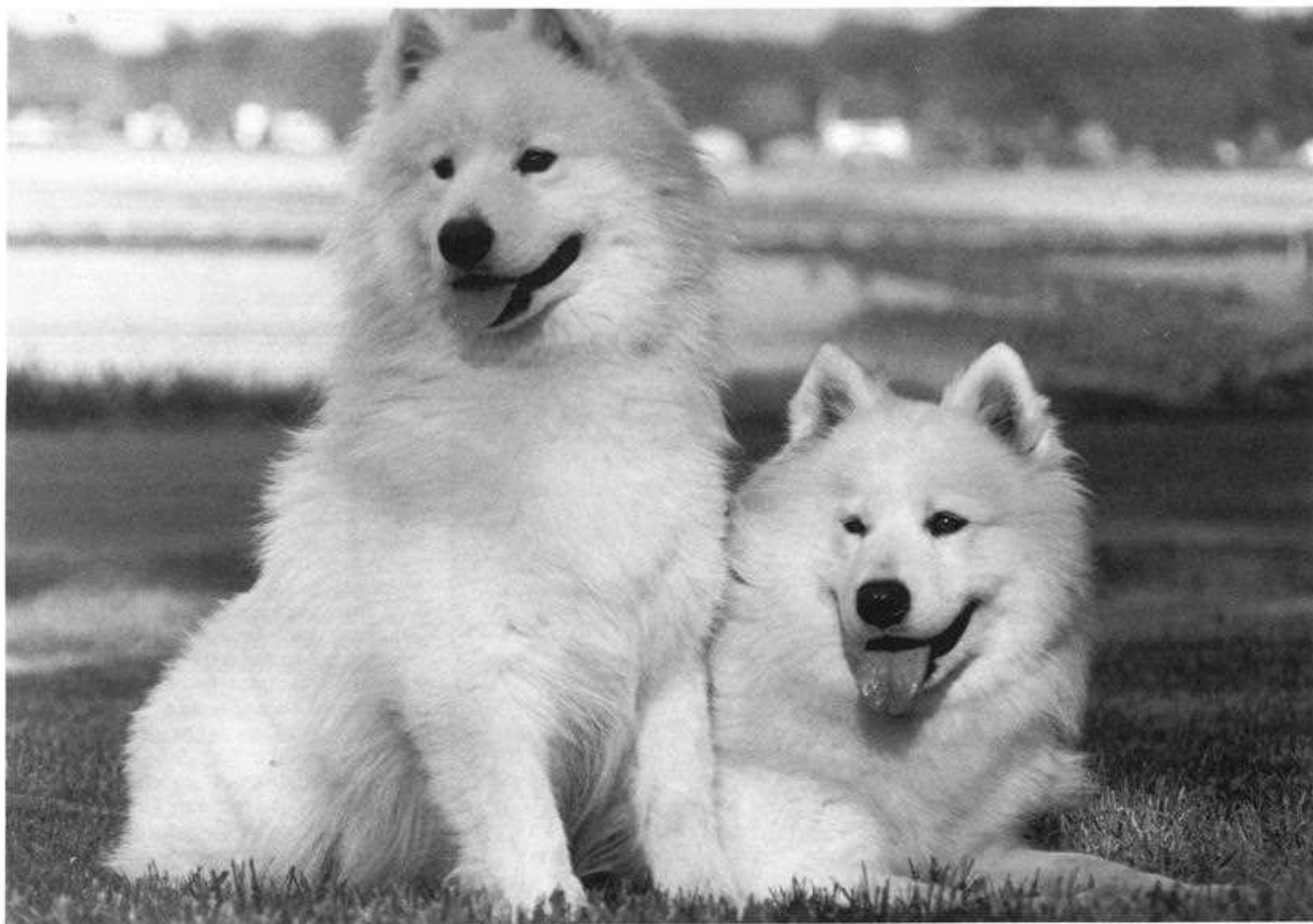
Ch. Kubla Khans Mr. Mauyak and Ch. Kubla Khans Dawn of Mayuak.

Carefully. I prefer linebreeding. You can only inbreed so far and you will start getting into problems in any line. This is