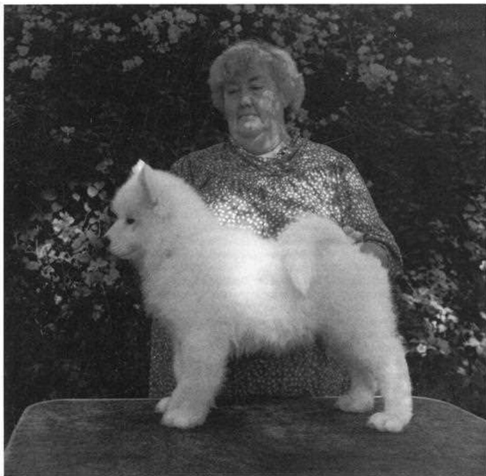
Pup sired by Icy.

I think so. There are people who still have my bloodlines, but they have been mixed with other bloodlines so they are not