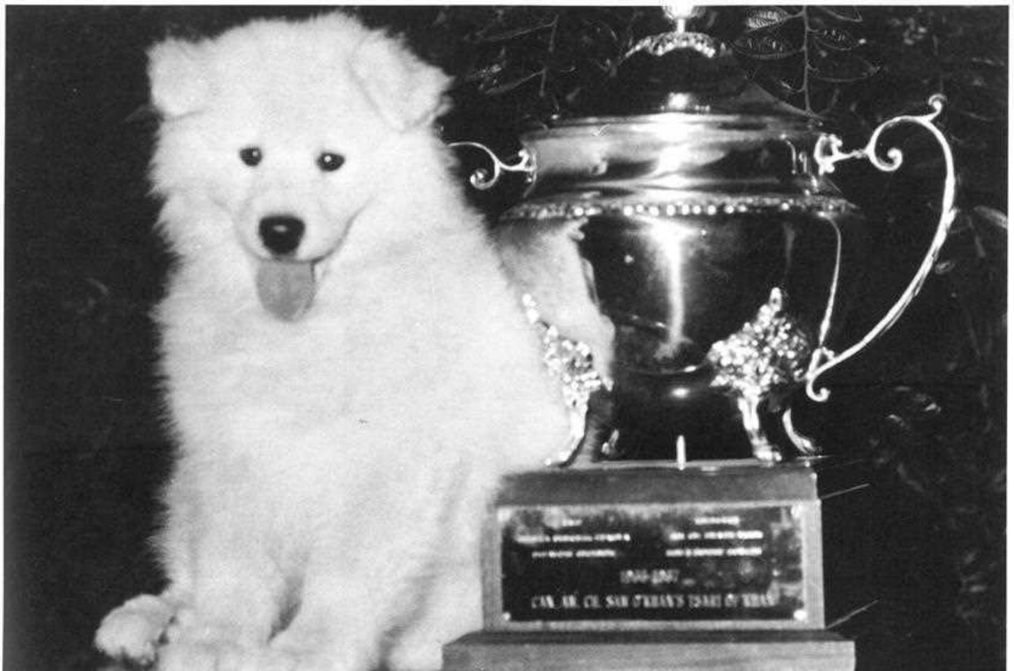
Ch. Scherezade of Kubla Khan.

twenty champions I bred and six I co-bred. I haven't bred any litters for a long time, for two reasons: I prefer judges who aren't actively breeding; also, you should always be ready to take them back. Sammies can live for fifteen years easily and you never know when they might lose their homes. A breeder should always be ready to lend assistance to at least find them another home. I really don't want to have a bunch of puppies out there, as I'm getting older. Breeders have that responsibility. I'm 65 now and I don't want to have tons of dogs