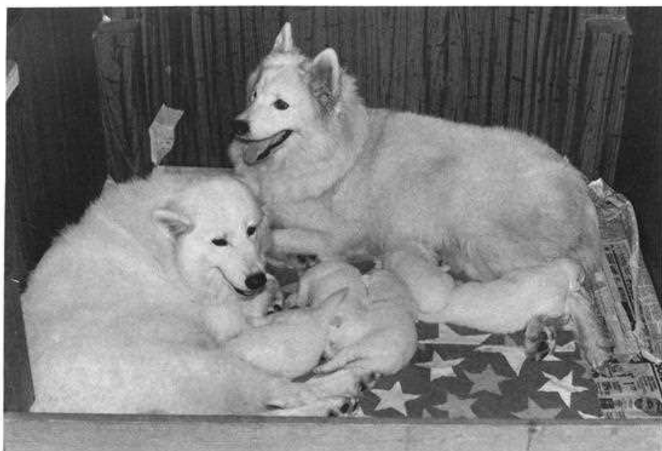
Ch. Tara is helping Sali clean her eleven-day-old puppies.

is sufficient breathing room. If the chest isn't shaped correctly the dog won't move correctly. It should not be a round chest, but a heart-shaped chest that goes below the elbow. That's what I look for. Dogs that are round don't look as good or move well. They roll along like a little barrel.