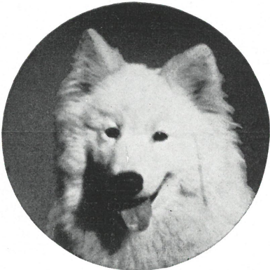
The White Christmas Sams

Snow Maiden of Snowland Kara Kobe of Oceanside Lensen's Snow Chief