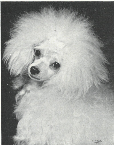
THE TOY POODLE