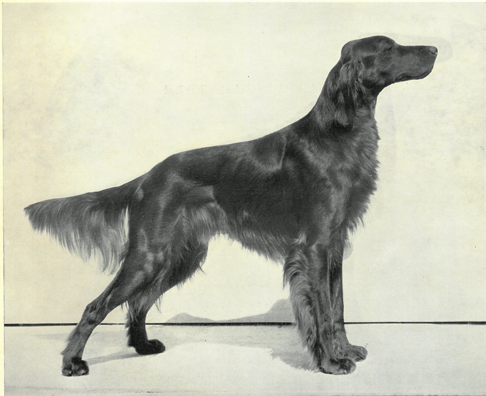
The Irish Setter, CH. COPPER COAT OF CROSSHAVEN — A. K. C. - 331199