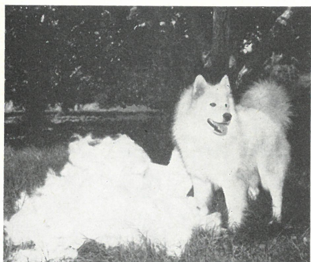
Puppies usually available from championship and imported bloodlines—watch this ad for notice of spring puppies

"We British breeders do so much appreciate the friendly kindness of the American Club members and wish you all the best and