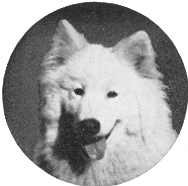
The White Christmas Sams

Snow Maiden of Snowland Kara Kobe of Oceanside Lensen's Snow Chief