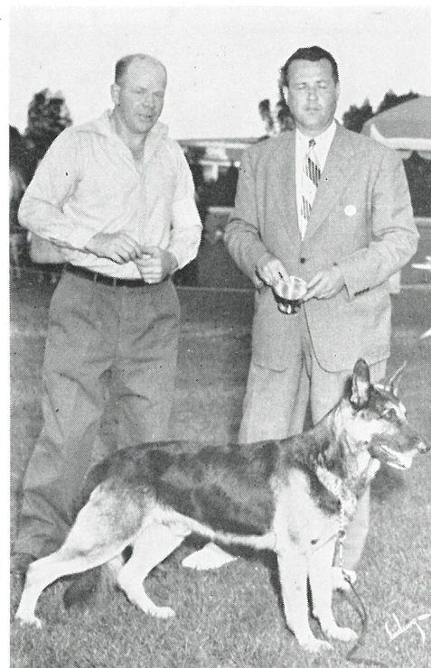
INTERNATIONAL CHAMPION Flint's Dewet of Wrenoma Lodge

points, Vallejo K. C., July 17th. Winter Creek Lodge is once again proud to announce another outstanding litter of puppies by these 2 superb specimens of the breed. Dewet and Xera are producing unexcelled temperament, heavy bone, high withers, hard backs, and tremendous angulation, both front and rear. The new family was whelped 29 August 1949, and are priced at $150.00 each.