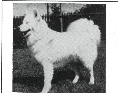
SNOWCREST'S TANYA Place Your Order for Puppies Now

Quite the outstanding dog in the classes and later, was the young Siberian Star of Altai—