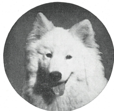
The White Christmas Sams

Kheta :- Snowy :- Nibby :- Bobby Greet You for 1951