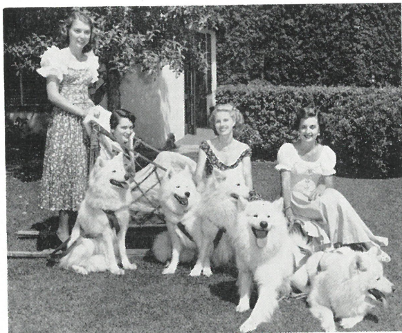
Some of the California Sams Doing Sled Work Ch. Starchak As Lead Dog.