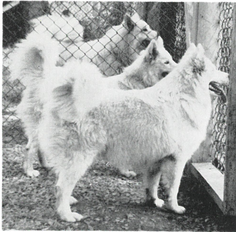
In foreground, Narguess of Top Acres (at 7 months), White Narcissus, born Oct. 15, 1949. Next her sister, Yasmin of Top Acres sire, Ch. Mart Snow Taz, dam, Ch. Sparkle Plenty of Artic in background. Ch. White Cap of Sno-White.

—for her. One of the English kennel owners uses herbs in the raising of all their dogs. This woman recommends several herbs which are