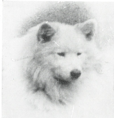
Jack Frost of Snow Shoe Hill At Stud

To Approved Bitches Only Correspondence Invited