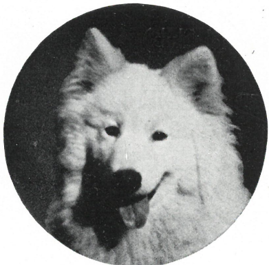
The White Christmas Sams

Snow Maiden of Snowland Kara Kobe of Oceanside Lensen's Snow Chief