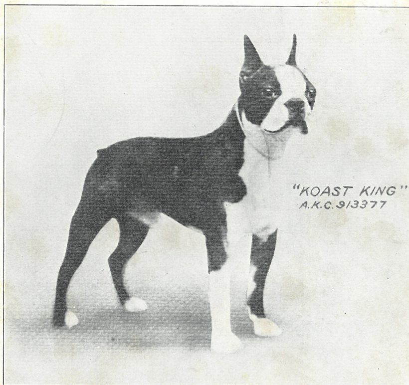
"KOAST KING" A.K.C. 913377