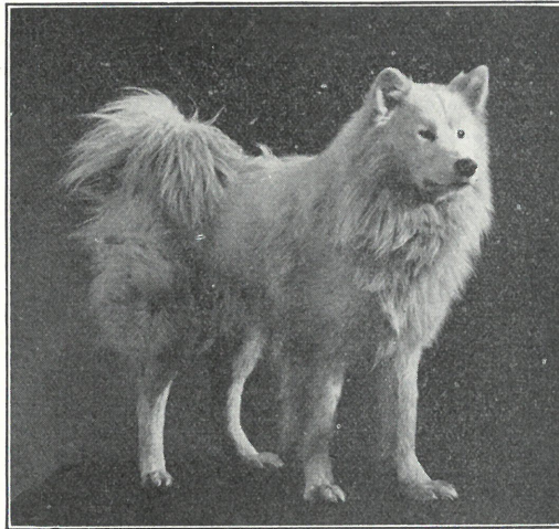
CH. DONERNA'S BARIN

Among our own numerous dogs I have seen the Barin character, the Barin smile