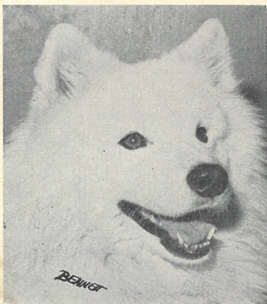
Champion Omak Sire of Champions

Just recently we took part in a Winter Carnival, and the amount of attention that the teams and their sleds attracted was truly amazing. Hundreds of pictures were taken. One of our group gave out no less than 35 kennel cards in