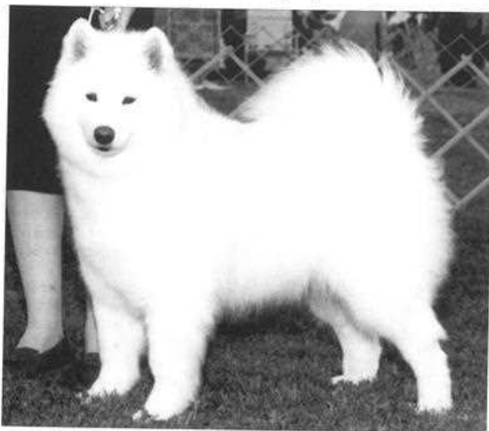
Ch. Noric Raisa O'Hobby Horse.