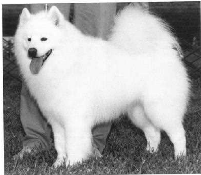
Above: Ch. Hobby Horse Nordic Karma.

Shauna: Not generally. Once in a while some of the dogs that we are showing or breeding I'll give a multi-vitamin, such as a PerTab. Also, we supplement our pregnant bitches with calcium, a balanced calcium-phosphorous tablet, while they are pregnant and while they are nursing the puppies. Other than that, we don't do a lot of supplementation.