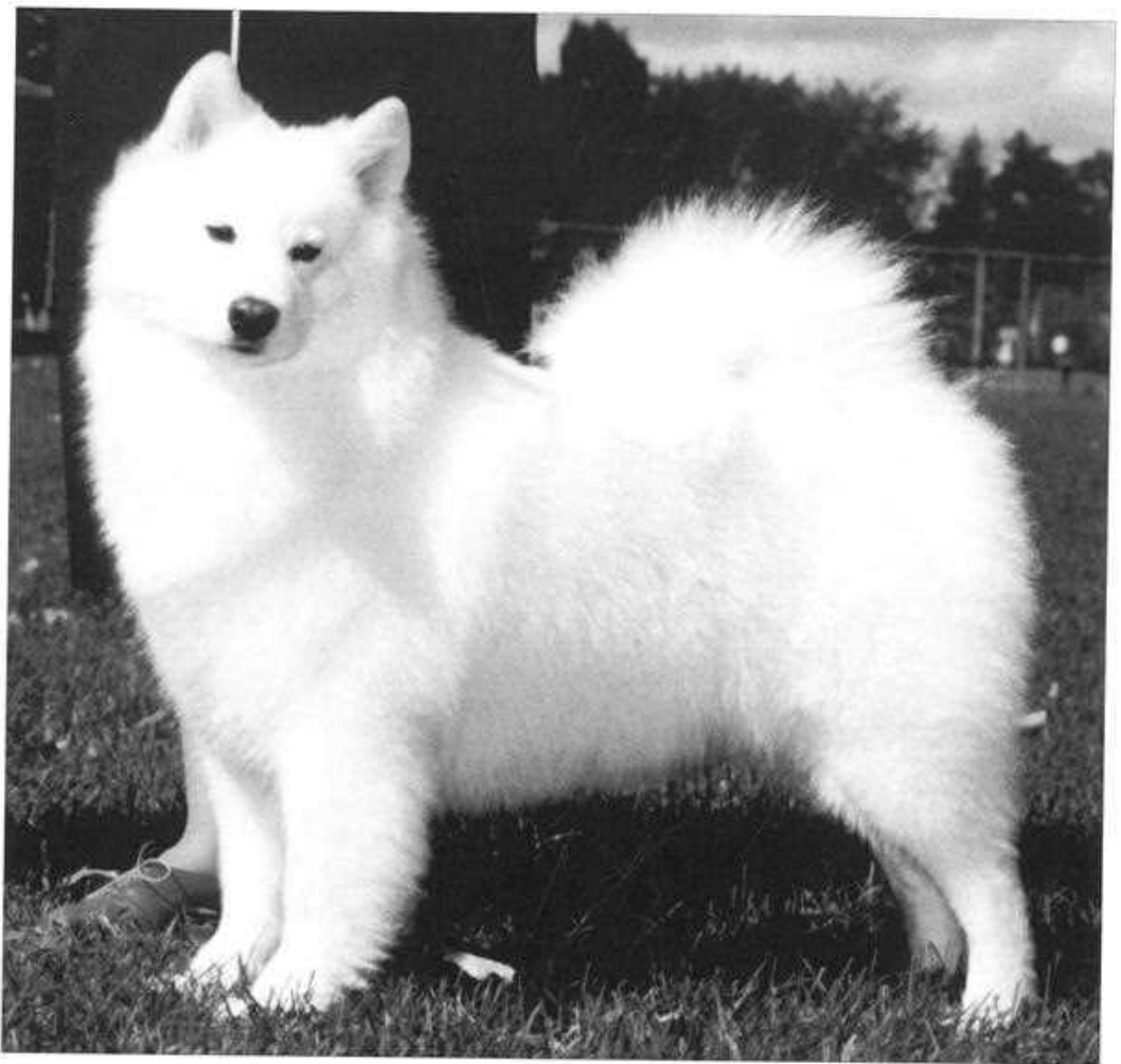
Am/Can Ch. Nodie's Silver.