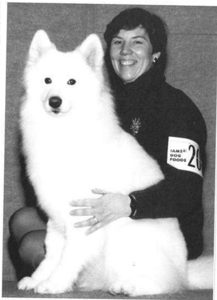
Ch. Hobby Horse Nordic Gem.