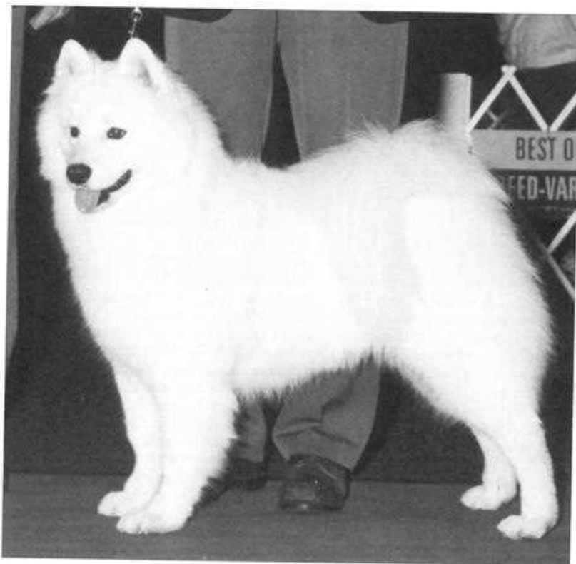
Ch. Nordic's Kealani.