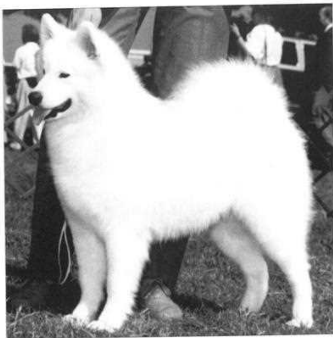
Ch. Hobby Horse Nordic Kameo.