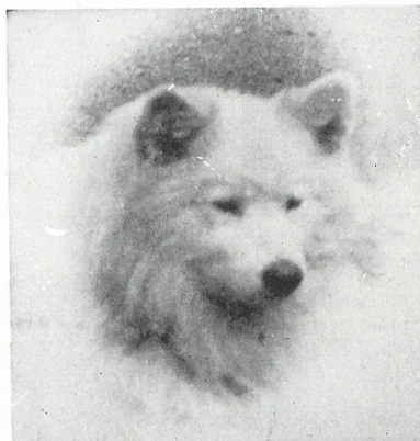
Puppies Occasionally — Selected Breeding Correspondence Invited JULIET T. GOODRICH