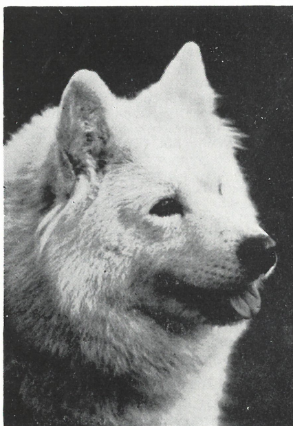
English and American Champion Princess Silvertips of Kobe