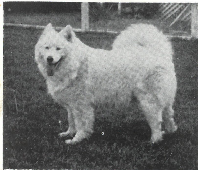
English and American Bloodlines Puppies — Stud Service