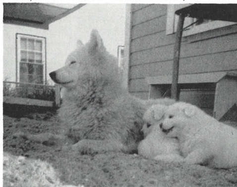
IMP. ADA OF SNOWLAND With two of the "Star" puppies sired by Irish and American Champion Snowland Stara.

We, in the Pacific Coast Division, who have