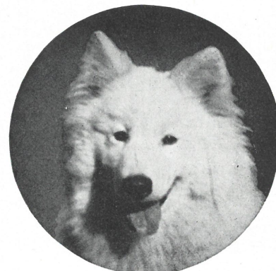
The White Christmas Sams