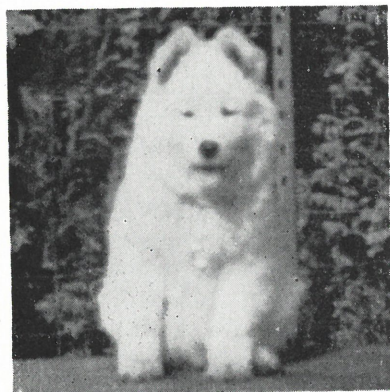
PUPPIES OF CHOICEST BLOODLINES

USUALLY AVAILABLE At STUD—Ch. Petra of Valiki and Vahnka of Lewclair