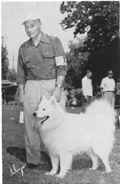
CH. SAMOYLAND SERGEI AT STUD