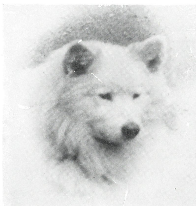
Jack Frost of Snow Shoe Hill At Stud