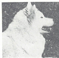
Lensen of White Christmas

(Ch. Borealis of the Far Steppes ex Dragoya of Wimundstrev)