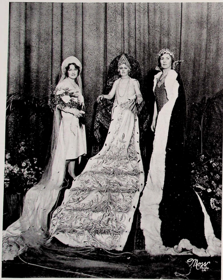
DRAMA DEPARTMENT'S LAST MEETING