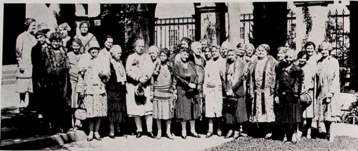
FORMER OFFICERS' ROUND TABLE