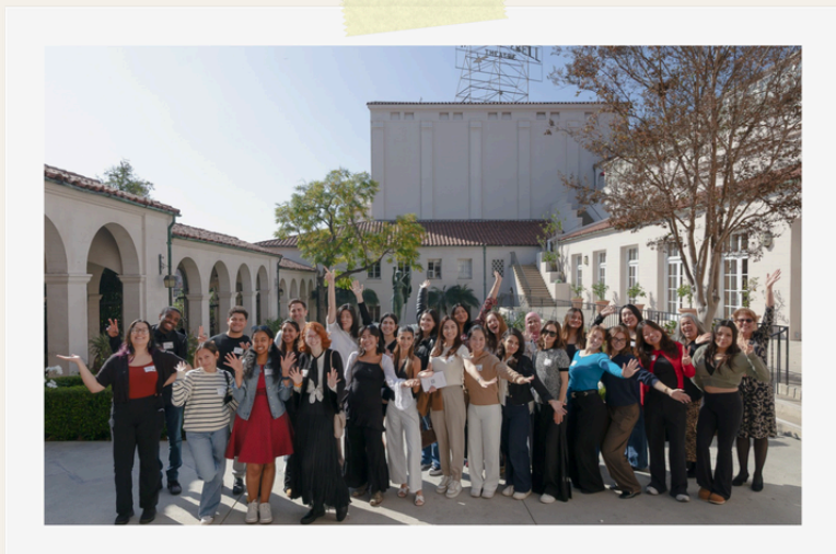
Photo from the February 7, 2026 Ebell/Flint Scholarship Breakfast

I love the idea of generations of women paying it forward to Los Angeles County college and university students (men and women). The Ebell/Flint Scholarship has made a difference since 1919!