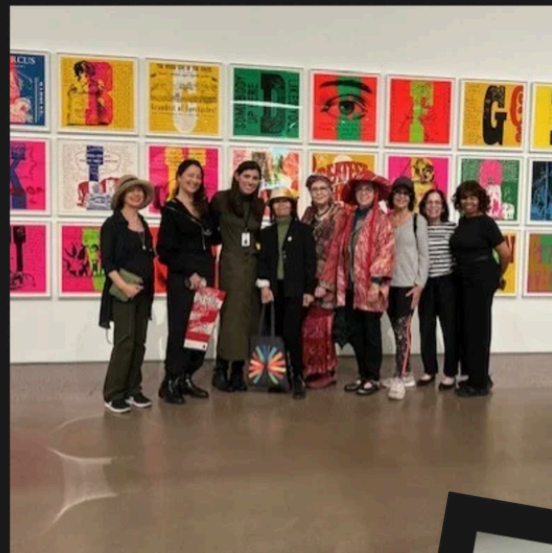
Marciano Art Foundation Field Trip