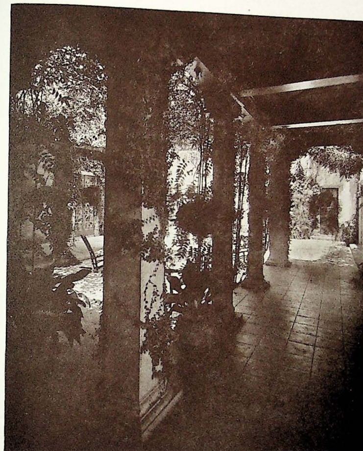
A CORNER OF THE COURT