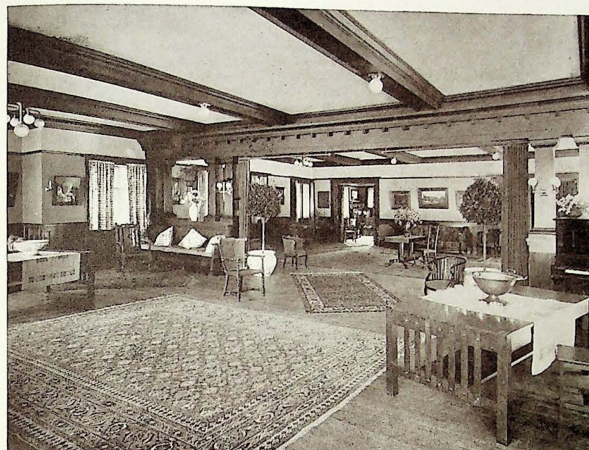
The Assembly Hall