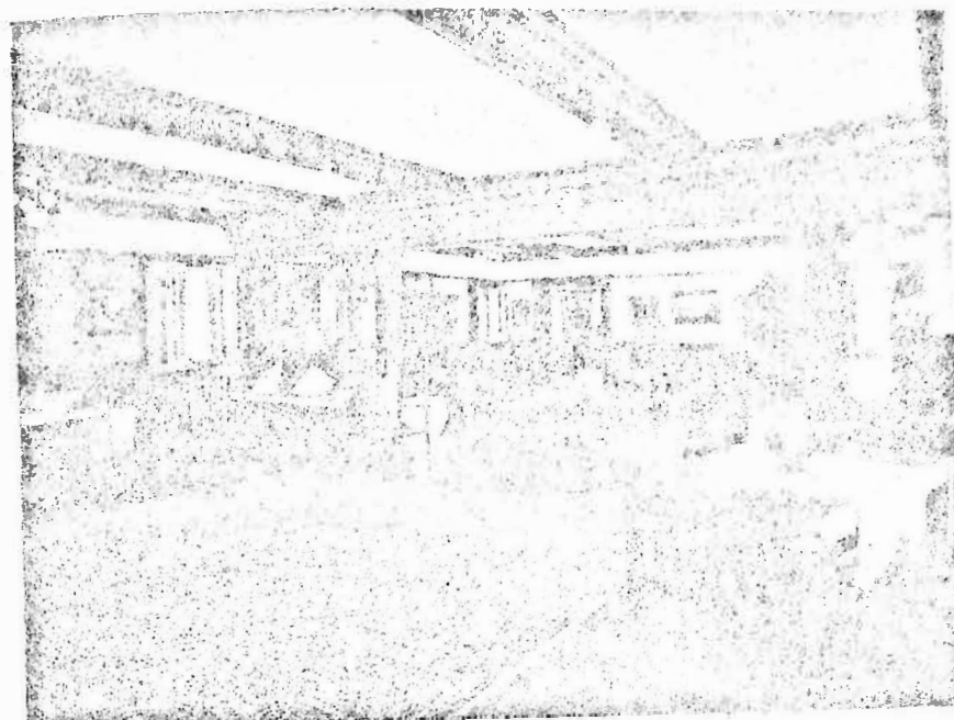
The Assembly Hall.