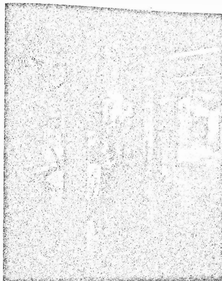
A CORNER OF THE COURT