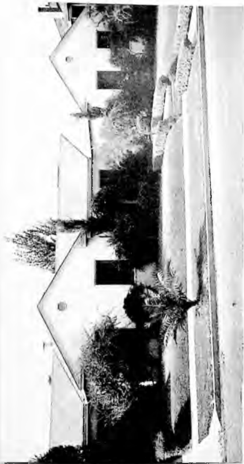
EBELL REST COTTAGE 135 North Park View Street