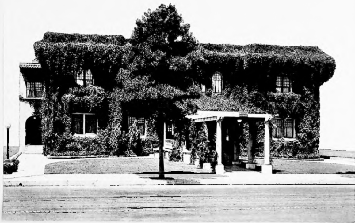
THE CLUB HOUSE