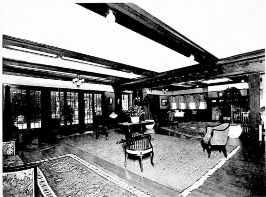
THE RECEPTION AND TEA ROOMS